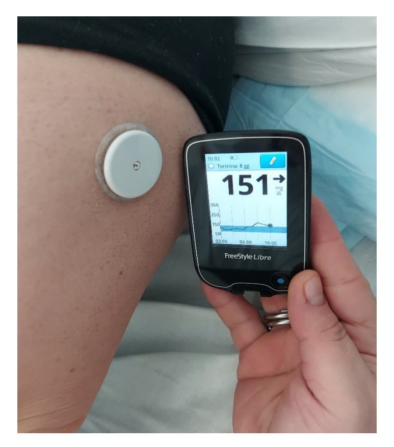
Figure 2. The sensor is applied to the arm of a patient with a subcutaneous needle measuring interstitial glucose levels. Measurements are viewed on a receiver unit (either a smartphone or dedicated receiver unit). This model is a FreeStyle Libre.

A clinical study reported that CGM yields a better description of glycemic variations during and after the dialysis treatment [36]. In particular, the presence of intradialytic asymptomatic hypoglycemia (16% of measurements) was not detected by routine BGM, but only after processing the data extracted from the CGM device. Moreover, the CGM also detected a hyperglycemic peak after dialysis in all patients, thereby highlighting a positive dialysis glucose balance. On the basis of these results, with the aim to prevent the hypoglycemia episodes, an additional measurement of plasma glucose after three hours of HD treatment has been suggested. Moreover, since during the dialysis session a decrease in the blood insulin level may also develop, in order to prevent the postdialysis glycemic peak and stabilize the patient's glycemic variability, an increase in the insulin therapy after the HD session have been suggested [36].