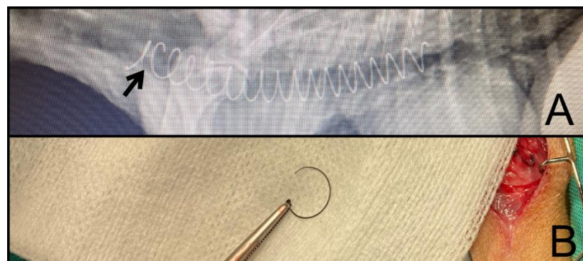
Figure 3. (A) Radiography of the fractured MSS. (B) Fragment removed after 220 days. MSS: Metallic spiral stent.