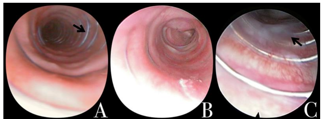
Figure 1. Tracheoscopy evaluation. (A) Naked MSS. No MSS contact (1) (arrow). (B) >80% MSS coated (2) (collapse of the canine can be observed caudal to the MSS). (C) Moderate mucous retention; isolated liquid mucous (1). MSS: Metallic spiral stent.

The contact between the MSS and the tracheal wall was divided into three groups: Both sides without contact (Group 0); one side without contact (Group 1); and the entire stent in contact (Group 2) (Figure 1). In the same way, the presence of granuloma was classified as 0, when no evidence was observed; 1, if only one granuloma was present; and 2, when more than one granuloma was present. Finally, tracheal congestion and stenosis were registered as present or absent.