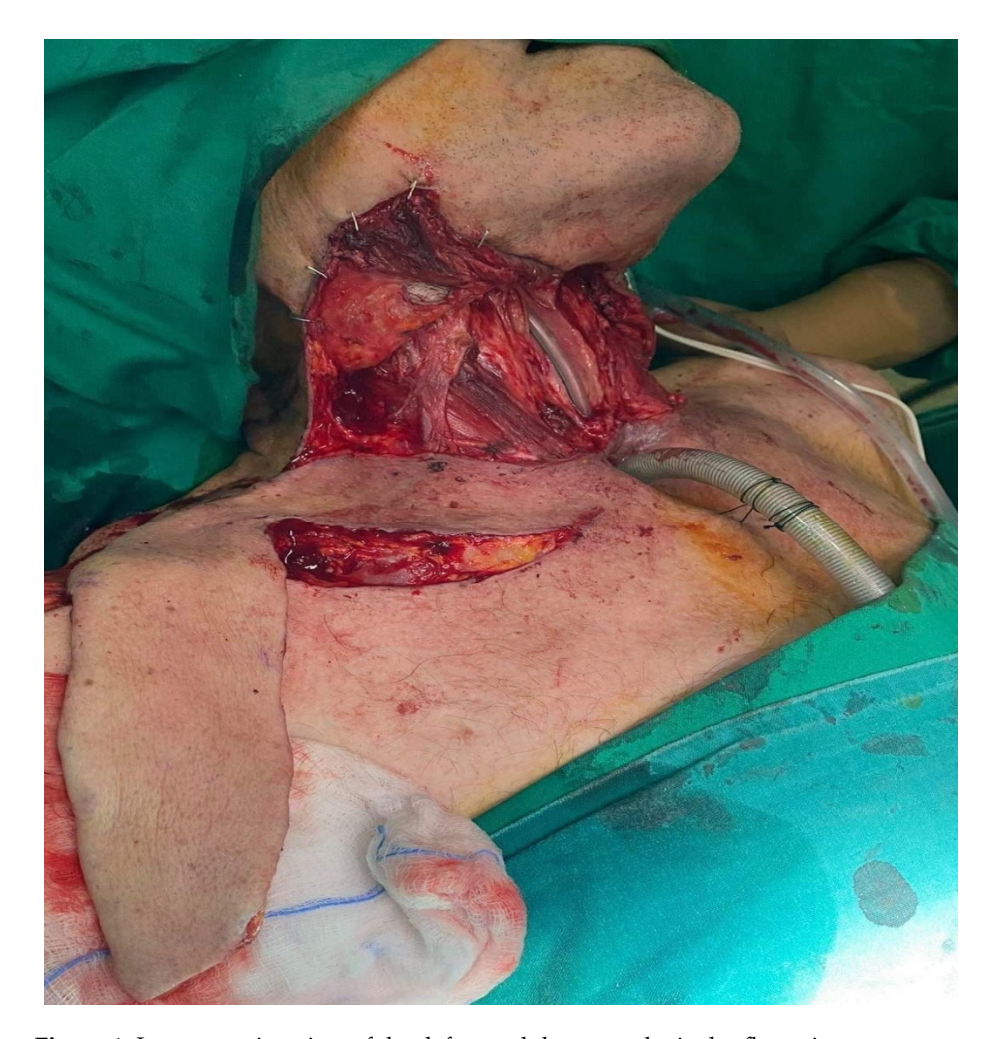
Figure 1. Intraoperative view of the defect and the supraclavicular flap raise.