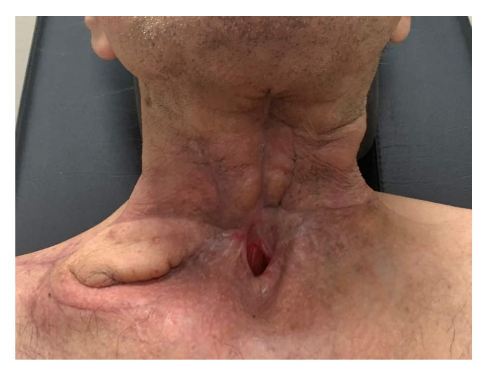
Figure 2. Aesthetic result at the 1-year follow-up.