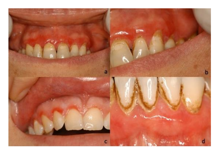
Figure 4. ( a , b ) Photograph of 67-year-old female, extensive erythematous lesion of all adherent gingiva in the maxilla; ( c ) 23-year-old female, erythema localized on the marginal site of 11, 12, 13; ( d ) 81-year-old female, erythematous lesions localized in the frontal area of the mandible.

No abnormalities were found in laboratory tests performed, such as number of red blood cells and platelets, number and type of white blood cells, amount of hemoglobin, or urinary tests.