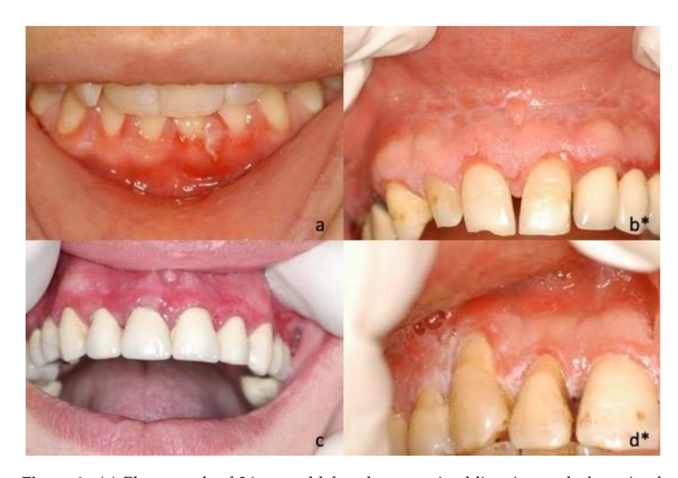
Figure 3. (a) Photograph of 36-year-old female, extensive blistering and ulcerative lesion of the marginal gingiva which extend beyond alveolar mucosa; (b) * 58-year-old female, reticular keratinization of the alveolar mucosa associated to homogeneous keratotic plaque of the adherent gingiva; it is possible to identify focal erythema in the marginal sites; (c) 56-year-old female, diffuse ulcerative and blistering lesions localized in the gingival area of the maxilla; (d) * 62-year-old female, focal keratinization in the papillary area of the upper right maxilla; the alveolar mucosa appears erythematous. * Clinically, four cases showed mixed lichenoid aspects which histological examination showed a dense plasma cell infiltrate, and it did not show a subepidermal band-like T CD8+ lymphocyte infiltrate.