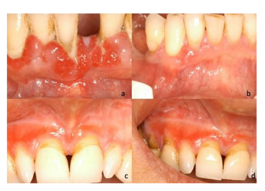
Figure 2. (a) Photograph of 76-year-old male, multiple hypertrophic lesions with erythema of the right mandible; (b) 81-year-old male, localized erythema of the marginal gingiva between 42–43. (c,d) Photographs pf 58-year-old female, mixed lichenoid aspects (keratinization and erythema) of the marginal gingiva and alveolar mucosa of the maxilla.