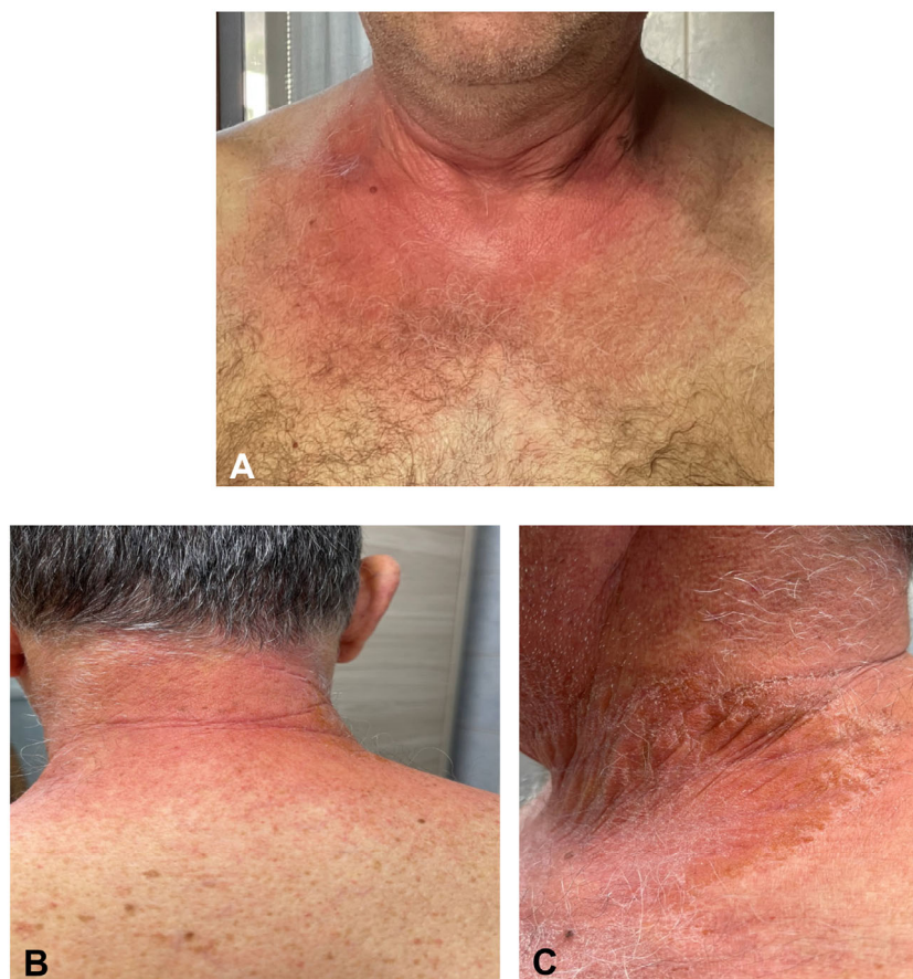
Figure 4. Erythematous and sharply demarcated lesions with symmetric and intertriginous-flexural distribution involving the neck and the gluteal area (symmetrical drug-related intertriginous and flexural exanthema—SDRIFE) developed on a 65-year-old physician two weeks after the BNT162b2 vaccine (A–C).