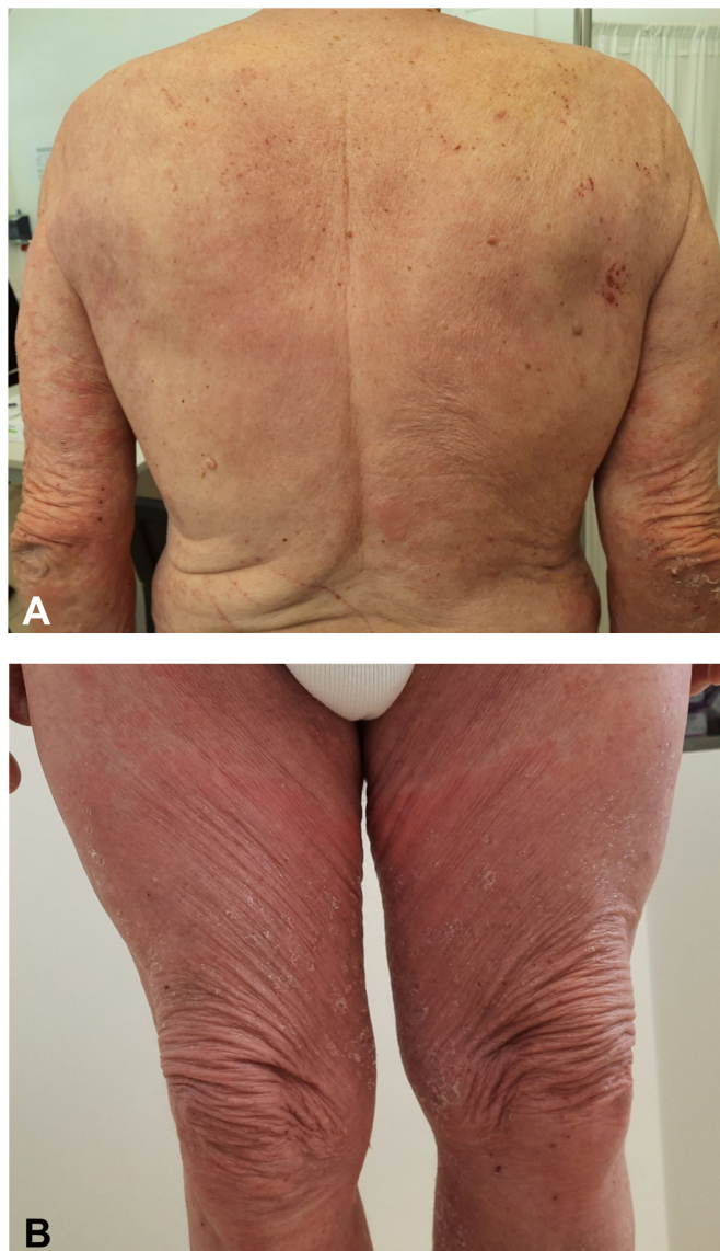
Figure 5. Diffuse bilateral eczematous lesions with overlying excoriation of the back, arms, and legs on a patient without a history of atopic dermatitis following the AZD1222 vaccine (71-year-old man) (A,B).