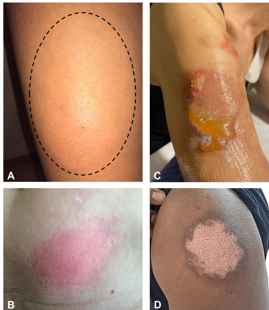
Figure 2. Edematous (A) and erythematous (B) indurated and tender plaques in the site of the injection developed one week after BNT162b2 vaccination in 36- and 67-year-old females, respectively. Burning bullous reactions on the deltoid area after the application of an ice pack to relieve the pain in a 56-year-old woman (C). Depigmented erythematous plaque of the deltoid skin developed in a 39-year-old African man three weeks after BNT162b2 vaccination (D).

ing in the area where the vaccine was inoculated [11,12]. Necrotic lesions characterized by angulated eschars surrounded by indurated erythematous borders at site of inoculation were reported one week after BNT162b2 vaccination [13]. The mean time to onset ranges from 4 to 11 days from the first [7,8,14] and 2–5 days from the second dose [7]. The COVID arm can recur with the booster but is, on average, likely to be less severe and may develop faster [7]. In the case of fever, the suspect of cellulitis should be ruled out [12]. Histopathology shows a superficial and deep perivascular lymphocytic infiltrate with dilated vessels, intraluminal neutrophils, and negative immunohistochemistry for the SARS-CoV-2 spike protein, consistent with delayed-type or T-cell-mediated hypersensitivity reactions [12]. Symptomatic therapies as antihistamines and/or topical glucocorticoids can be used for treatment, as for drug-induced injection site reactions [14,15]. No serious adverse reactions have been reported after the second dose. Burning bullous reactions have been observed after the application of an ice pack for a relief from pain (Figure 2C). Pigmentary changes (hyper or hypo) may follow the acute phase, especially after more severe reactions (Figure 2D).