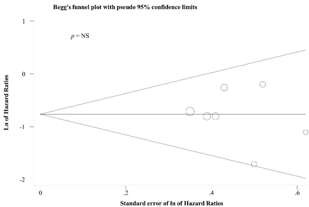
Figure S2 Begg's funnel plot for the assessment of publication bias (NS = non-significant)