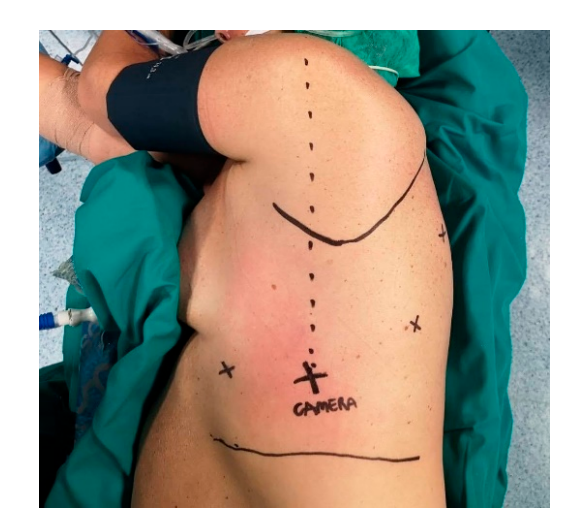
Figure 1. Standard port-mapping for totally endoscopic robotic lobectomy.