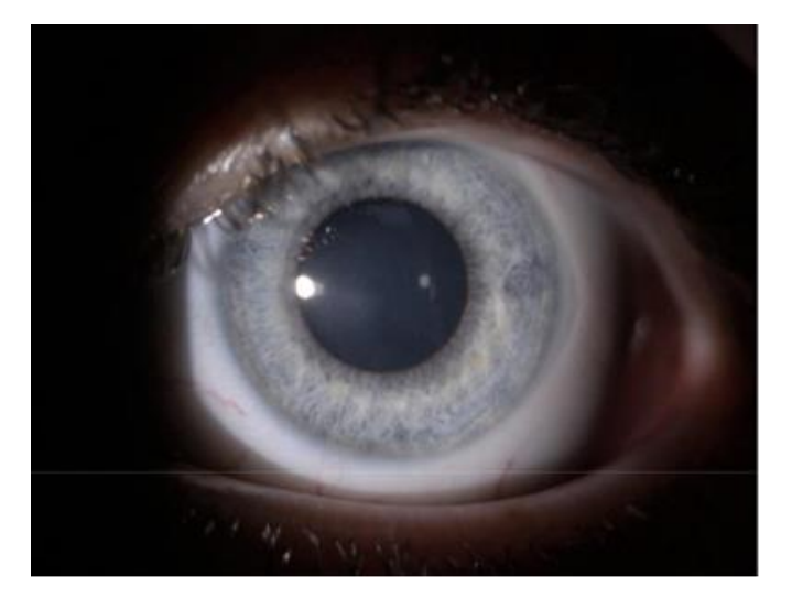
Figure 3. Slit lamp image of the left eye of the same patient 2 months after cxl.

Figure 2. Slit lamp image of the same patient's eye 4 days after cxl. Visible cornea covered with epithelium with dendritic ulceration paracentral. Reduction in endothelial deposits and significant reduction in corneal edema and haze.