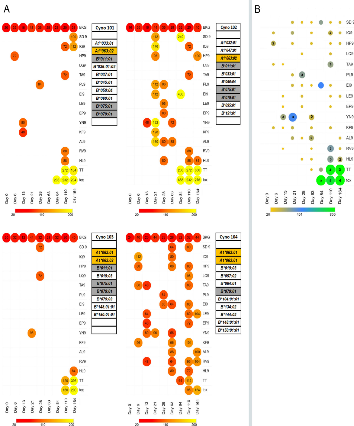
Figure 3. Time course study of macaque ELISpot reactivity to selected MARV peptides following microsphere vaccination. (A) Four Cynomolgus macaques carrying the Mafa-A*062 MHC genotype were vaccinated with synthetic peptides corresponding to Mafa-A063 restricted CD8+ T cell

on immunogenic epitopes in the Cynomolgus model. We further note that despite the genetic similarities at the MHC Class I locus of the macaque study cohort, the pattern of T cell responses between probands was dissimilar, probably attributable to other genetic influences (e.g., genes associated with antigen processing and presentation or MHC Class I expression or T Cell receptors) lying both within and outside the MHC.