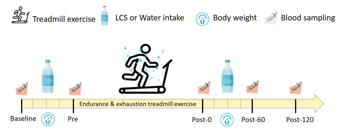
Figure 1. Experimental scheme. The experiment was based on a crossover double-blind design. The participants engaged in the treadmill exercise for 60 min with 70% maximal oxygen consumption (\dot{VO}_{2max}) intensity, followed by 90% \dot{VO}_{2max} until exhaustion. The indicated fluid was ingested at a rate of 600 mL/h (150 mL/15 min) before and after exhaustive endurance exercise. The participants' BW information and blood samples were collected at indicated time points. LCS, low-osmolality carbohydrate–electrolyte solution; Pre, Pre-exercise; Post-0, Immediately after exercise; Post-60, 60 min after exercise; Post-120, 120 min after exercise.