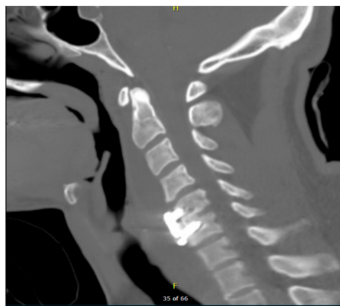
Figure 2. Postoperative CT scan showing spinal cord decompression following surgical discectomy and anterior arthrodesis of the C5–C6 vertebrae. CT scan = computerized tomography scan.

On follow up at one month, the patient had resolution of his numbness and paresthesia, however, he continued to note posterior midline neck pain. He reported cannabinoid and methamphetamine use despite discussion to avoid drugs while fusion was occurring. He was subsequently lost to follow up.