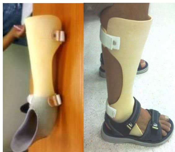
Figure 2. AAFO, anterior ankle foot orthosis.