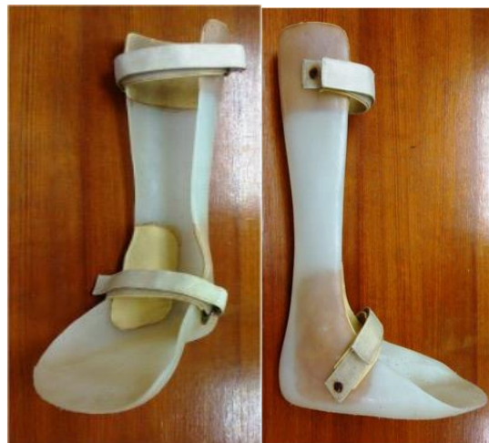
Figure 3. PAFO, posterior ankle foot orthosis.