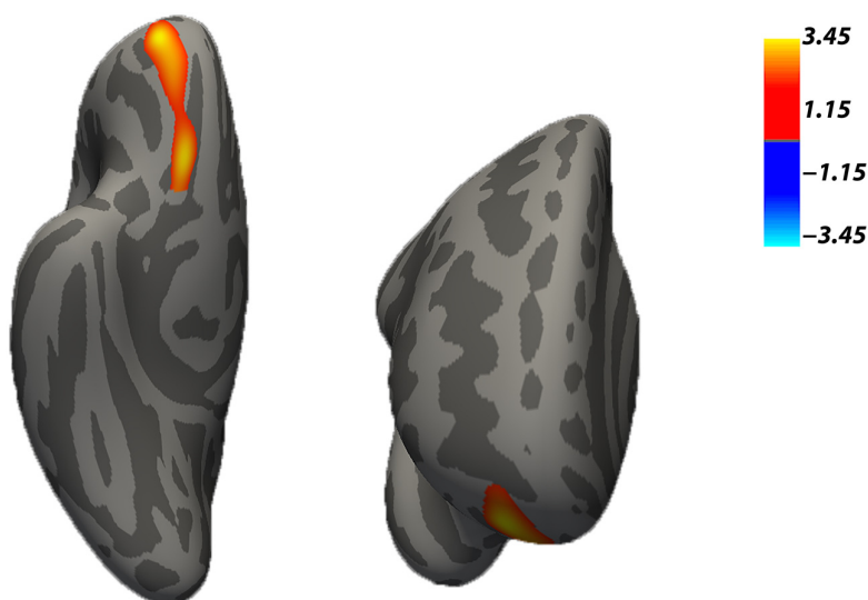
Figure 1. The cortical thickness reduction in Neglect versus Control groups. The cluster comprises the right rostral middle frontal gyrus, as part of the dorsolateral frontal gyrus, and the lateral and medial orbitofrontal areas. Background brain images represent the inferior ( left image) and anterior ( right image) views of the right inflated hemisphere of (FreeSurfer) fsaverage brain. Note: p < 0.05 cluster-wise corrected, 10,000 Monte Carlo iterations, age, and Psychiatric Disorders were included as nuisance covariates for the cortical thickness analysis.

The results in the cortical surface area, applying a CFT = 0.001, revealed a significant pattern of greater surface area in mothers of the NG with respect to the CG (CG < NG) in the occipitotemporal region previously hypothesized. The analysis showed a large cluster ( p = 0.0002 , see Table 3 bottom and Figure 2) extending over the right lingual and lateral occipital gyri of the right hemisphere.