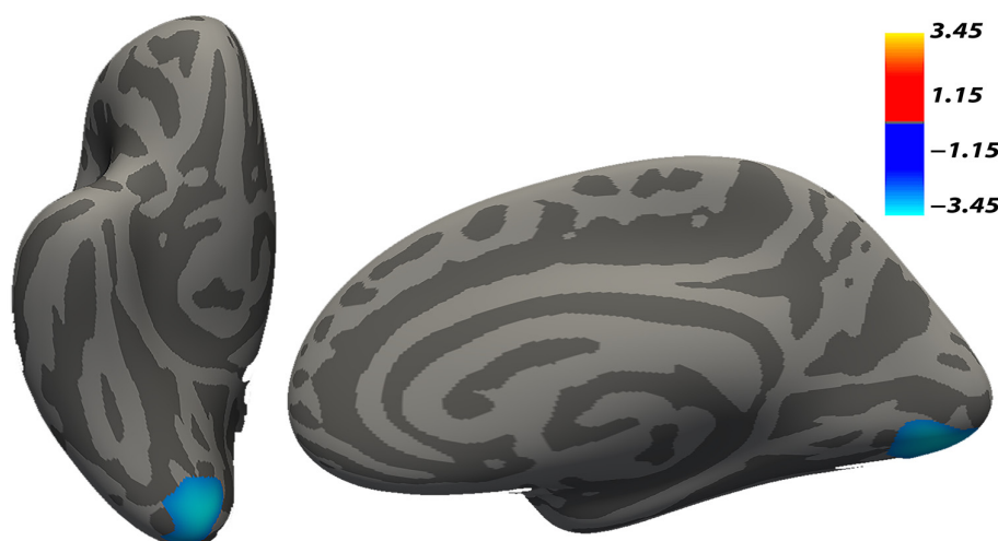
Figure 2. The increased cortical surface area in Neglect versus Control groups. The cluster comprises lingual and lateral occipital regions. Background brain images represent the inferior ( left image) and medial ( right image) views of the right inflated hemisphere (FreeSurfer) fsaverage brain. Note: p < 0.05 cluster-wise corrected, 10,000 Monte Carlo iterations, age, total intracranial volume (TIV) and Psychiatric Disorders were used as nuisance covariates for the cortical surface area analysis.