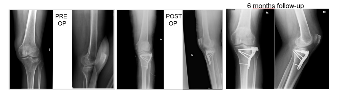
Figure 1. Fifty-seven-year-old patient, X-rays: preoperative, postoperative and control at 6 months follow up of a Shatzker type 2 fracture, AO 41 B1.3.