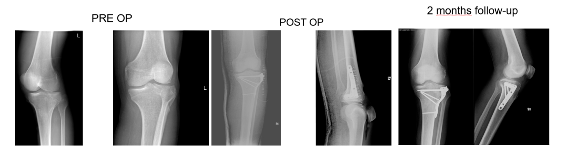
Figure 3. 68 years old patient, X-rays: preoperative, postoperative and control at 2 months follow up of a Shatzker type 2 fracture, AO 41 B1.3.