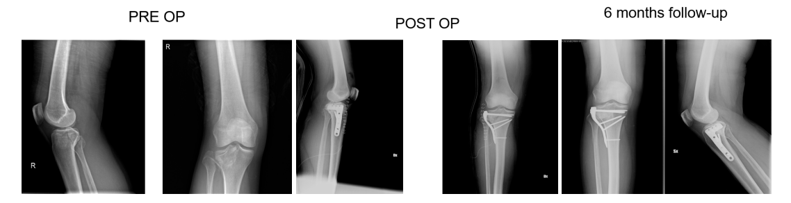
Figure 2. Sixty-year-old patient, X-rays: preoperative, postoperative and control at 6 months follow up of a Shatzker type 3 fracture, AO 41 B 1.3.