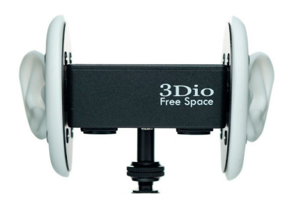
Figure 5. Binaural microphones from 3Dio, Free space binaural microphones.