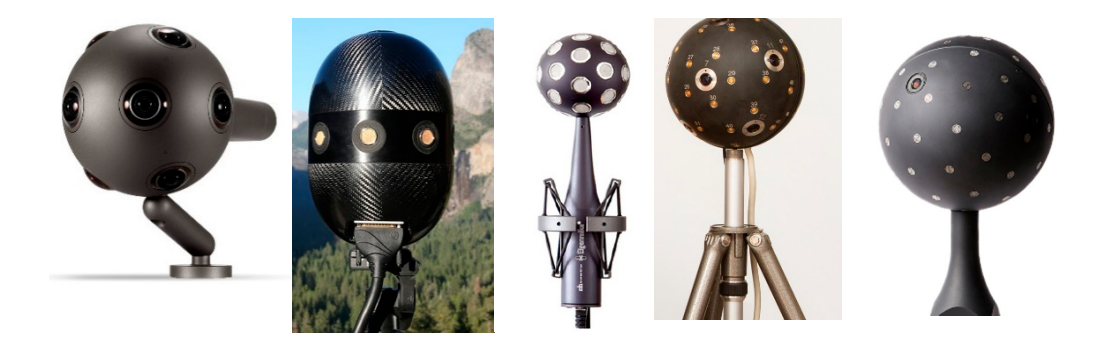
Figure 2. Examples of spherical microphone array (from left to right) from Nokia OZO with 8 microphones, Dysonics Randomic with 8 channels, Eigenmike with 32 channels, B&K with 36 channels, and VisiSonics with 64 channels.