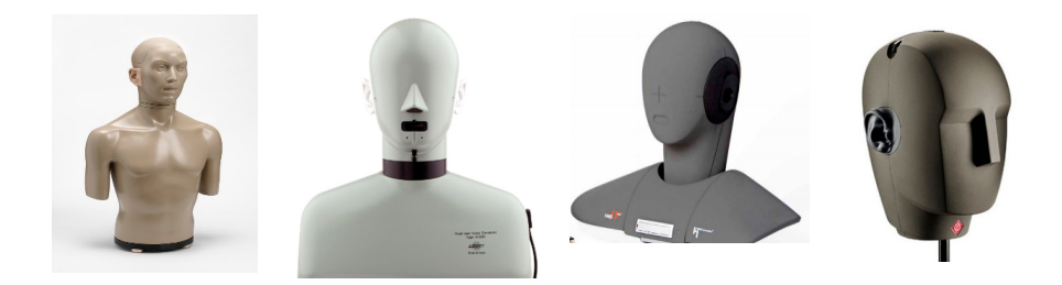
Figure 4. Dummy heads (from left to right): KEMAR, Brüel & Kjær 4128 HATS, Head Acoustics HMS III, and Neumann KU-100. Note that Neumann KU-100 dummy head is torso-free.