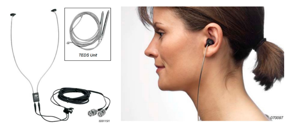
Figure 3. Brüel & Kjær 4101 Binaural microphone worn on the ear.

In addition to the use of human beings for binaural recording, dummy heads are also commonly used in academia and the industry to obtain consistent and comparable results. A dummy head usually consists of a torso, head and ears, which are made up of special materials whose acoustic properties are similar to human body and its anthropometry generally follows closely with the average of the whole or a certain part of the population [44]. Several dummy heads that consist of a torso, head and ears include KEMAR (Knowles Electronics Manikin for Acoustic Research) [45], Brüel & Kjær 4128 HATS (head and torso simulator) [46], Head acoustics HMS IV [47], as shown in Figure 4. An example for dummy heads with only a head and two ears is the Neumann KU-100 [48]. As shown in Figure 5, the 3Dio binaural microphones [45] offer superb portability for binaural recording when compared to the bulky dummy heads, but at the expense of lacking head shadowing effects due to the absence of a head. Furthermore, the 3Dio omni binaural microphone records sound from four different head orientations, which could probably be more useful in interactive spatial audio in VR applications.