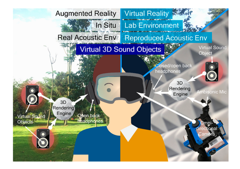
Figure 8. (Left) AR setup with spatial audio from rendered virtual sound objects for in situ environments. ( Right ) A lab-based VR setup from omni-directional camera recordings and a reproduced acoustic environment using spatial audio from ambisonic microphone recordings and rendered virtual sound objects [97].

These devices and upcoming innovations would be useful for projects that involve altering the soundscapes of existing locations. They could be used in soundscape studies to test different hypothesis in an immersive environment, which allows both virtual reproduced and real ambient sounds to be heard at the same time. AR devices have the advantage of including different elements of the perceptual construct of the soundscape, including meteorological conditions and other sensory factors [7]. Moreover, if accurate spatial sound is used with these AR devices, it would enable the soundscape researchers to fuse the virtual sound sources seamlessly with the real sound, thus enabling highly accurate interpretation of auditory sensation by the user. The viability of an augmented reality audio-visual system has been demonstrated with a consumer AR headgear and open-backed headphones with positional translation- and head-tracked spatial audio, as shown in the left half of Figure 8.