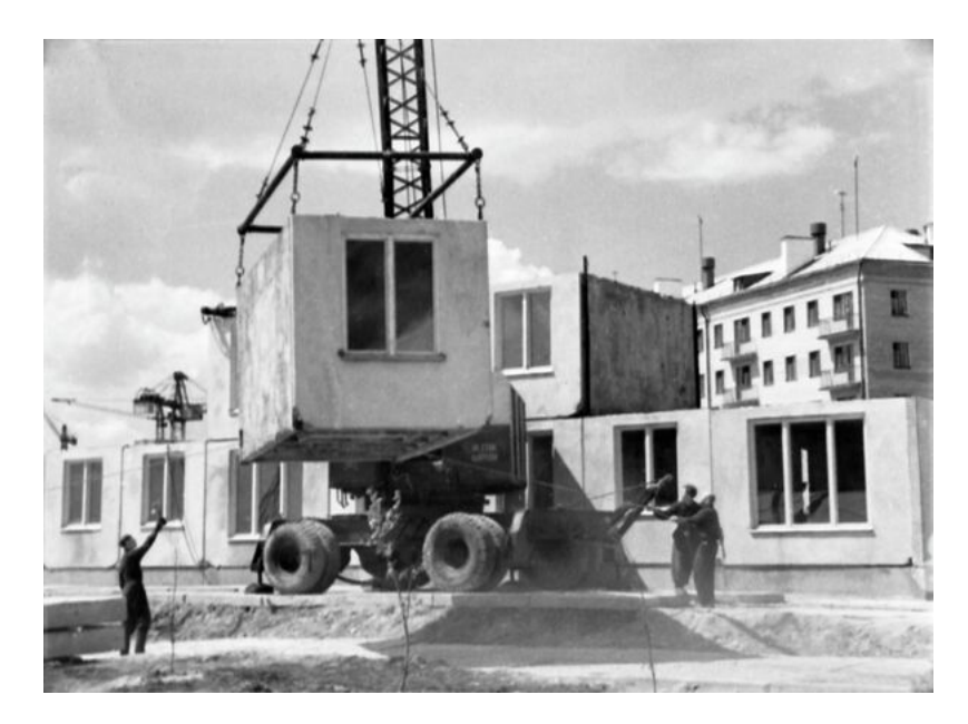
Figure 1. Installation of volumetric blocks.

However, with the development of technology and improvement of the quality of construction, it has become possible to build houses from blocks, and it becomes more technologically advanced, high-quality and economically attractive compared to classical construction methods.