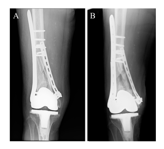
Figure 1. Radiographs of a distal femur fracture indicating non-union at 6 months postoperatively. The patient was a 79-year-old female who underwent a total knee replacement and had a distal femur fracture ( A ). A noticeable deficiency in callus formation is observed, which may be attributed in part to the rigidity of the bridging implant and the absence of motion. Observations included apparent fracture dislocation, bone atrophy, and, notably, plate failure ( B ). The corresponding author obtained written informed consent from the patient.