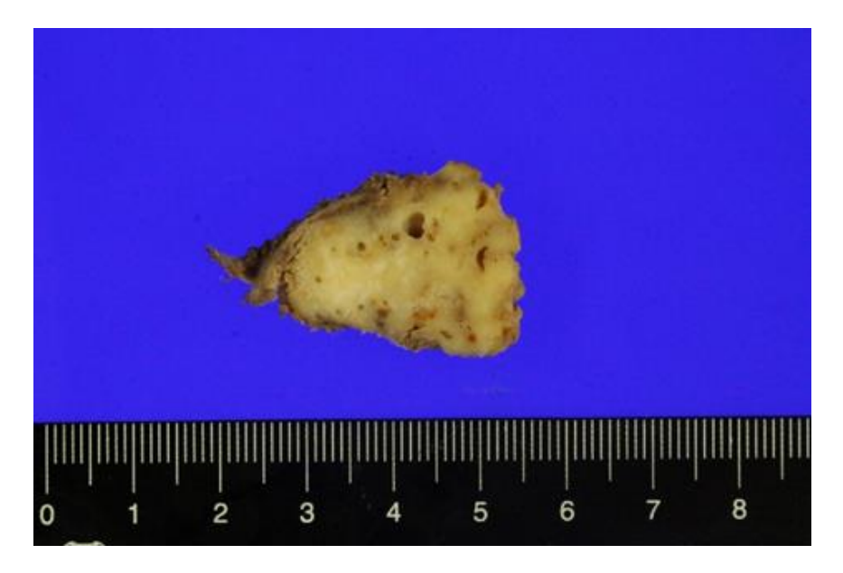
Figure 3. Cut surface of the resected specimen.

diagnosed. After complete resection of the tumor, postoperative normalization of laboratory values was confirmed. At the patient's follow-up visit, her clinical symptoms related to osteomalacia improved, with no evidence of recurrence of tumor. Furthermore, following surgery, she had been visiting the endocrinologist regularly for postoperative follow-up.