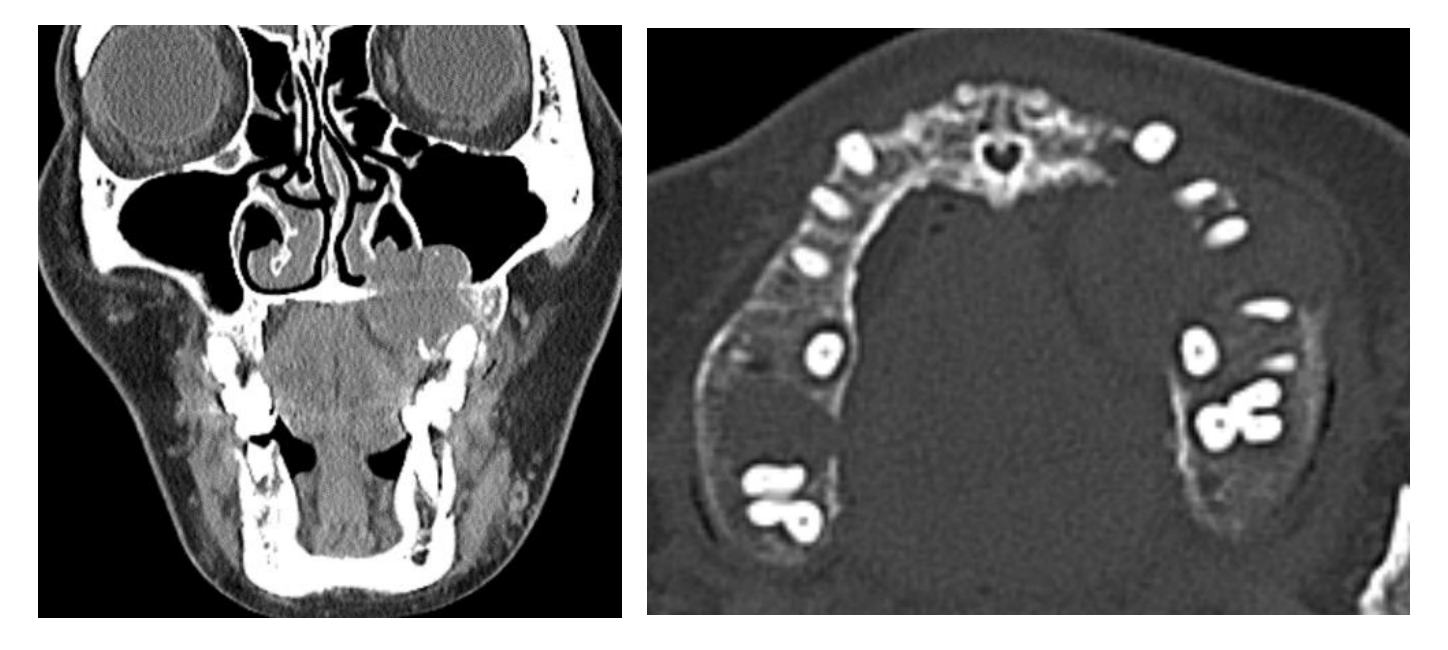
Figure 2. Preoperative contrast-enhanced computed tomography image presenting radiolucent lesion evading adjacent bone.

Radiological examination through contrast-enhanced computed tomography showed a soft tissue mass (about 2.7 \times 2.2 \times 2.2 cm) in the left maxilla occupying the left maxillary sinus and left nasal middle meatus and extending to the left side of maxilla and teeth. There was an intraosseous osteolytic lesion evading the adjacent maxilla (Figure 2).