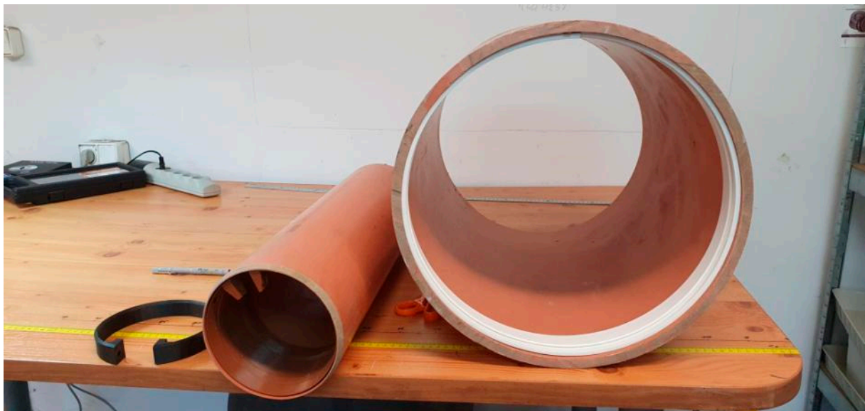
Figure S4. Examples of mounted straps on a 400 mm diameter sewage pipe: in the middle, a wide strap made of brown ABS; on the left, a narrow strap made of black ABS.