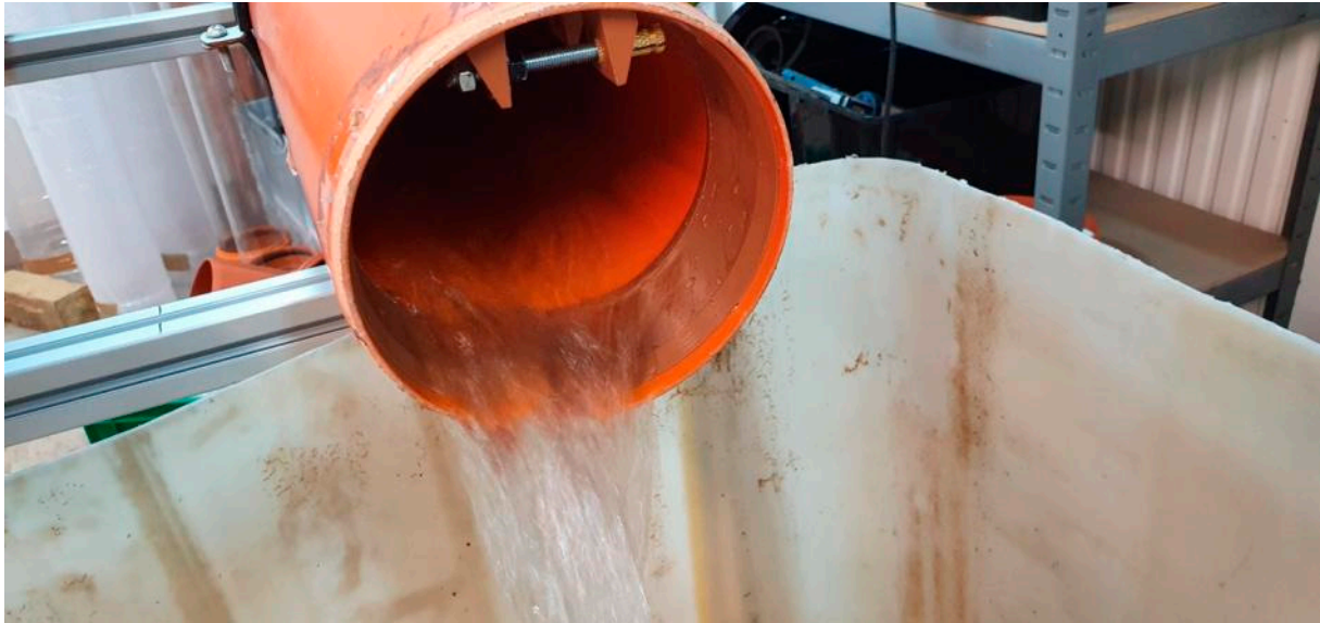
Figure S1. ABS ULTRAT measurement strap securely attached in a streamlined shape, printed using 3D technology.