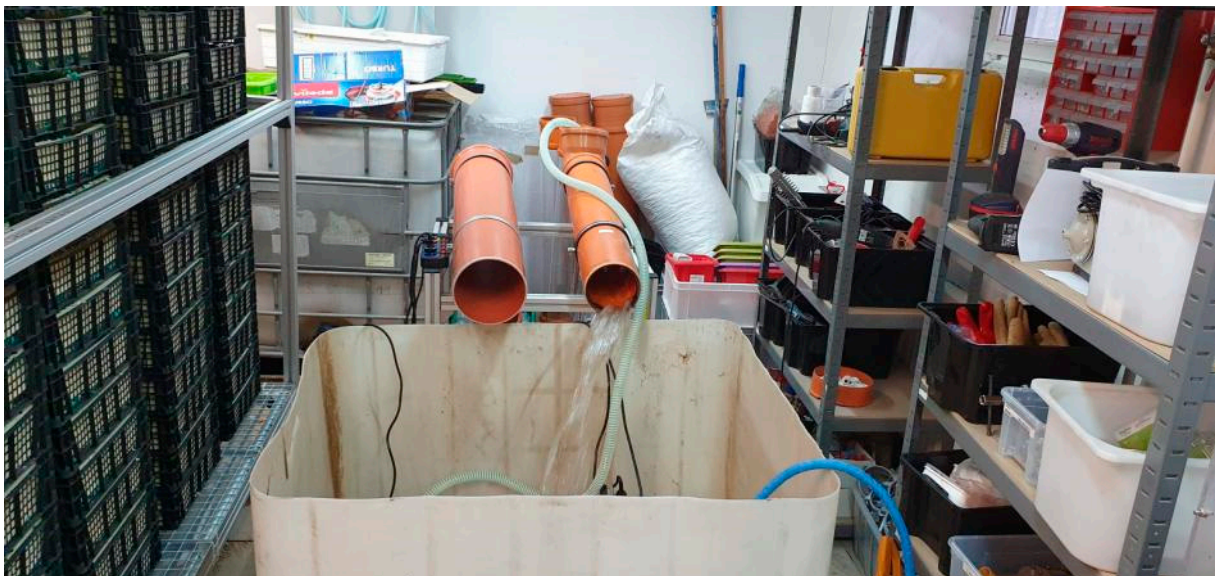
Figure S2. View of the research setup during hydraulic load testing with water flow.