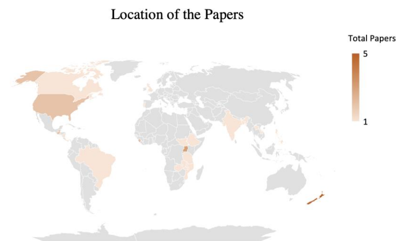
Figure 2. Geographical distribution of studies conducted.

In addition to the studies centered around African countries, other papers were concentrated in Central/South American and Caribbean countries such as Nicaragua [33], Guatemala [35,37], Haiti [39], Panama [47], and Brazil [55]. Furthermore, developed countries with western medicine, who incorporated POCUS into their medical institutions in Portugal [46], United States [48,56], New Zealand (rural hospitals) [50–54], United Kingdom [23], Newfoundland and Labrador, were analyzed [58]. More specifically, all of the New Zealand-based papers that were reviewed selected five to six rural hospitals to examine, many of which were dispersed to represent various communities within the rural areas of New Zealand [53–57]. The rest of the studies contained settings from Asia in countries such as Bangladesh [44], Laos [41], the Philippines [45], and India [23]. The studies carried out in Bangladesh and Laos were from urban areas, with the Bangladesh study focusing on a large tertiary government hospital (Chittagong Medical College, Chittagong, Bangladesh), and the Laos study focusing on Vientiane, the capital of Laos [41,44]. The geographical distribution of the countries included in this study is visualized in Figure 2.