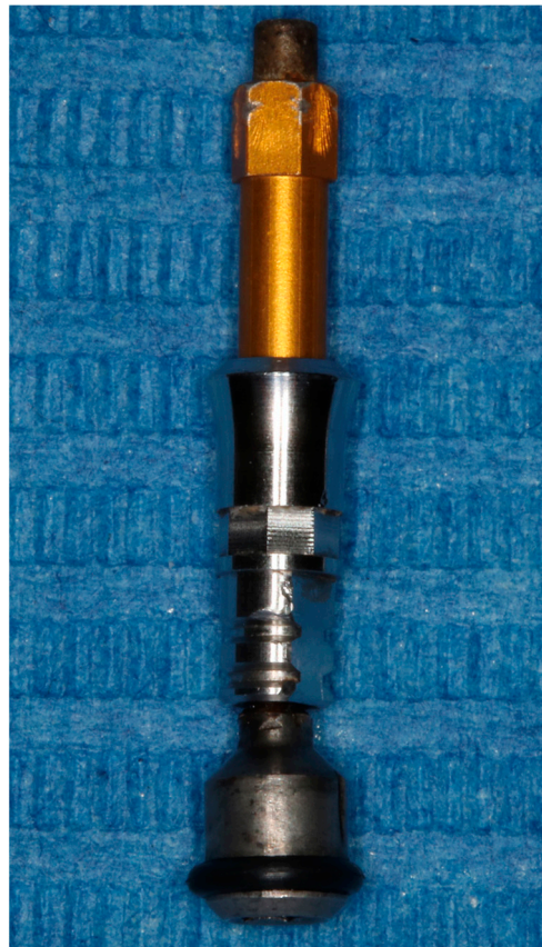
Figure 3. Device designed to be fixed on the head of the mini-screw from one side and the SmartPeg from the other side.