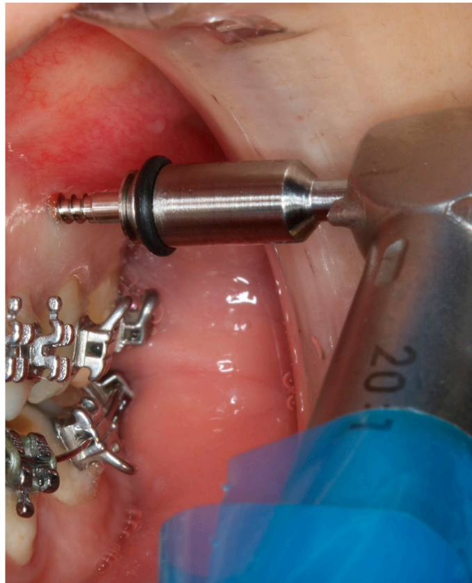
Figure 2. Mini-screw insertion.

Regarding mini-screw insertion and stability measurements: 40 mini-screws M.O.S.A.S self-drilling 25M-16208 (Dewimed Medizintechnik GmbH, Tuttlingen, Germany) were inserted with an 8 mm length and a diameter of 1.6 mm using an implant motor with a 40 N torque. All of the mini-screws were positioned at a 90-degree angle in the attached gingiva, 1 mm below the mucogingival junction of the right and the left maxilla between the first and second premolar or the second premolar and first molar (Figure 2).