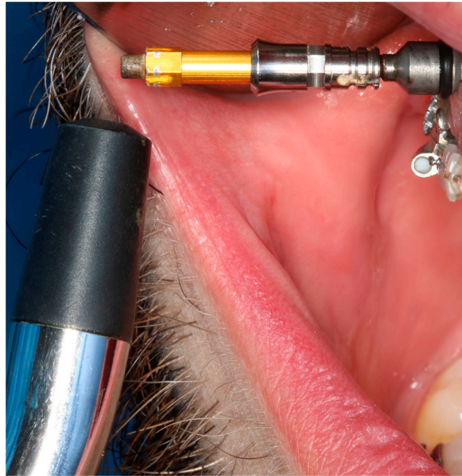
Figure 5. Stability measurement by the Osstell ISQ.