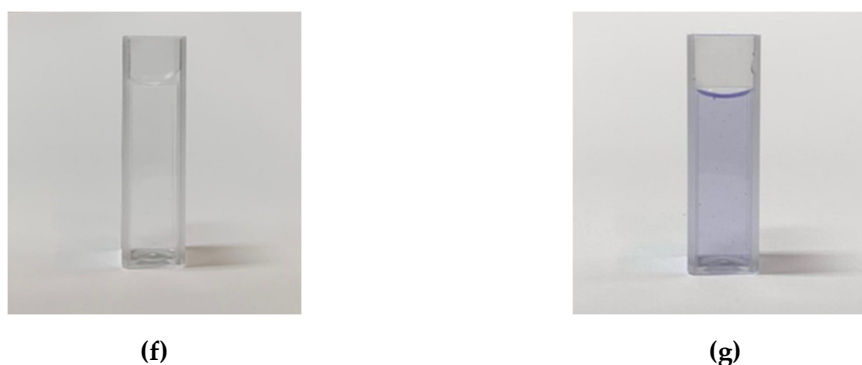
Figure S1. Image of CV solution before the adsorption process (a); images of CV solution after 8 steps of filtration for 100 mg of aerogel (b) and 100 mg of cryogel (c); images of CV solution after 8 steps of filtration for 200 mg of aerogels (d) and 200 mg of cryogel (e); images of CV solution after 8 steps of filtration for 300 mg of aerogel (f) and 300 mg of cryogel (g).