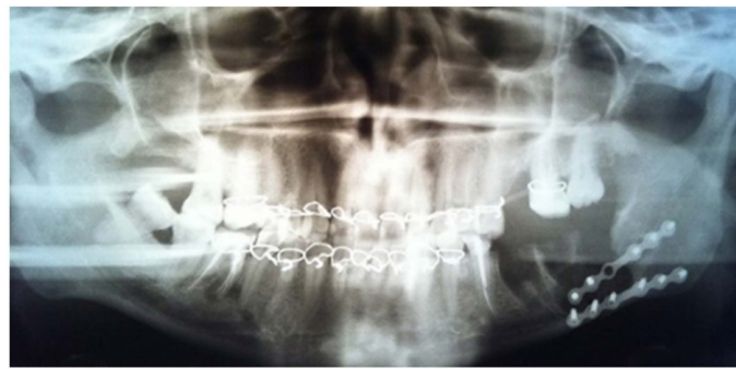
Figure 4. Patient orthopantomogram 1 day after surgery.

In the early postoperative period, a control panoramic view was made. The bone cavity, after extraction of the teeth and cystectomy, was visualized; titanium plates and screws were placed in the right positions. Additionally, the bone fragments were relocated into the correct position (Figure 4).