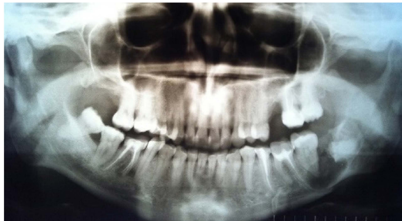
Figure 1. Orthopantomogram before surgery.

jaw, with fragment displacement, occurred; the fracture line passed through the sockets of teeth 3.7 and 3.8 (Figure 2).