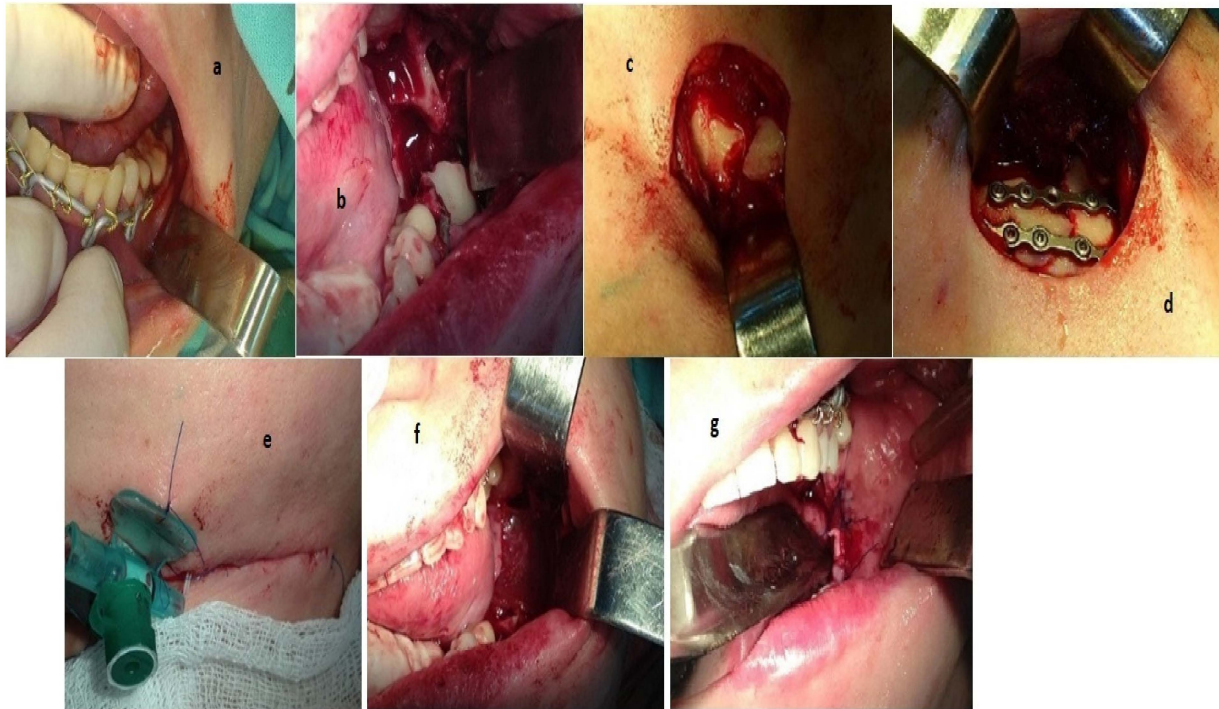
Figure 3. (a) Teeth 3.6, 3.7 and 3.8; (b) founded bone cavity and fracture line; (c) fracture line visualization; (d) osteosynthesis; (e) sutured skin after the intervention; (f) the membrane covers the graft and bone defect; (g) imposed interrupted sutures in the area of the postoperative wound.

Stage 1. Teeth 3.6, 3.7 and 3.8 were removed (Figure 3a).