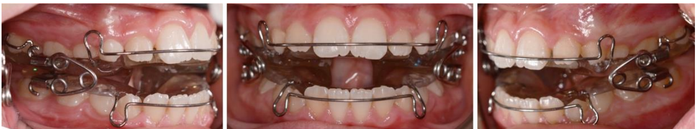
Figure 1. PK appliance.

Patients belonging to the treated group underwent a treatment protocol consisting of two phases. In the first treatment phase, the PK appliance [7] (Figure 1) was used for about 15 months, with the aim of maintaining the position of the upper jaw and promoting mandibular growth, controlling its growth in the vertical plane, in order to establish a Class I molar relationship and a correct relationship between the incisors. In the permanent dentition, the second treatment phase was performed with fixed upper and lower appliances with the aim of aligning and leveling the arches to achieve a stable occlusion. Treatment with fixed appliances lasted for about 12 months on average and it was performed with standard Edgewise brackets with 0.022 \times 0.028 inch slots. As for the arch sequence, it comprised 0.016 inch CuNiTi and beta-titanium archwires followed by 0.017 \times 0.025 inch and 0.019 \times 0.025 inch stainless steel archwires. Finishing was achieved with 0.016 and 0.017 \times 0.025 inch beta-titanium archwires. Retention after the fixed appliances was performed with upper and lower Hawley retainers.