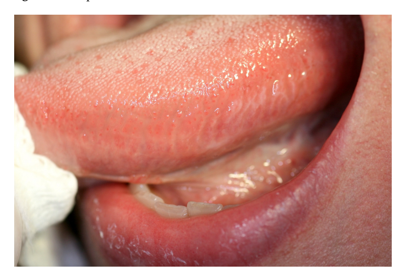
Figure 3. Left border of the tongue two weeks after the amalgam removal. Mucosal signs were strongly improved. The patient reported no symptoms.