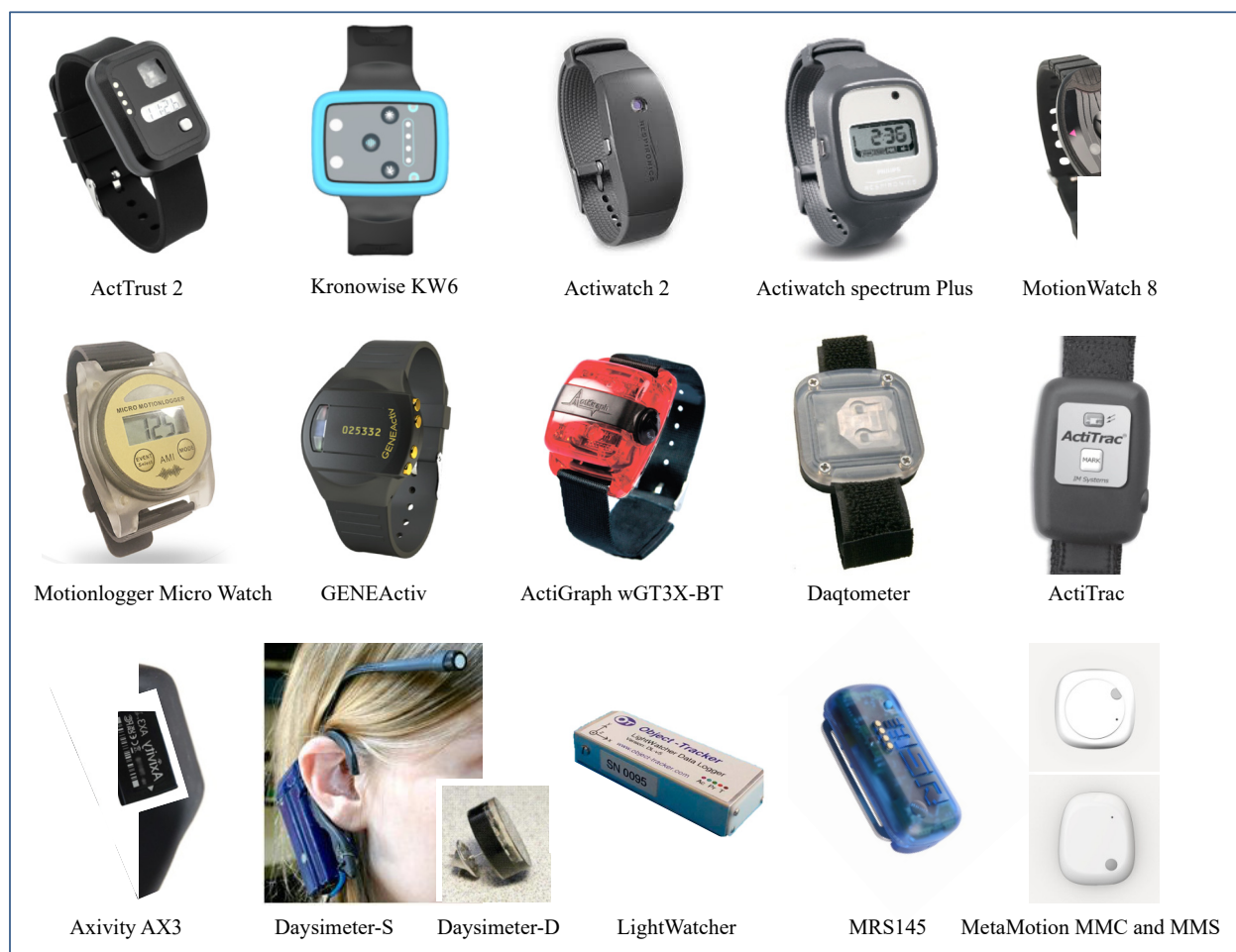
Figure 1. Reviewed dataloggers (pictures taken from manufacturers' websites or scientific articles (mentioned in Table S1)).

An important issue is the material from which the strap is made (vinyl, polyurethane resin, silicone, plastic, etc.), as there are cases of skin irritation (e.g., [22]). To cope with this problem, the GENEActiv, for example, is offered with straps in different materials to accommodate allergies. Otherwise, a cotton sublayer may be individually prepared for such wearer to be attached under the strap.