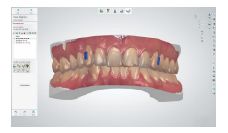
Figure 2. A 3Shape software used in this example to design a maxillary clear aligner.