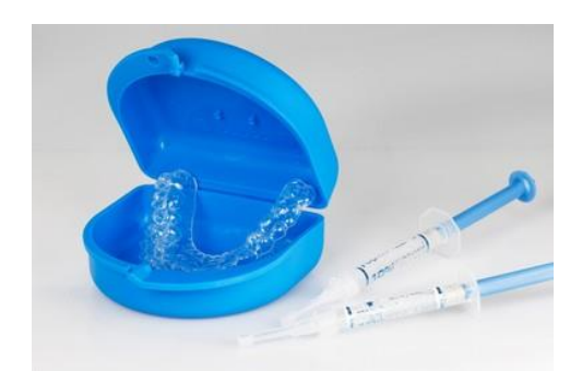
Figure 3. Home bleaching kit with a tray which is worn at night until the desired tooth shade is achieved.

At-home tooth whitening (Figure 3) has been a common approach to whiten the teeth since its introduction in 1989 by Haywood and Heymann [22–24]. This is attributed to its efficiency, lower cost, feasibility, and reduced adverse effects such as tooth sensitivity and soft tissue burns [25–28].