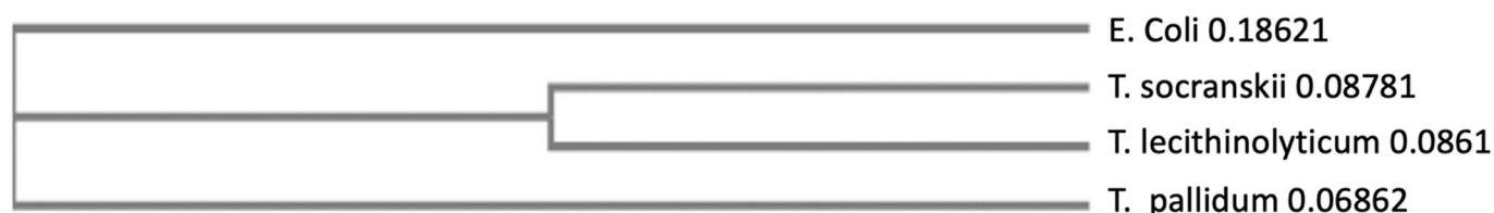
Figure 3. CLUSTAL-OMEGA phylogenetic tree.

The phylogenetic tree (Figure 3) clearly shows that E. coli was different from the other species analyzed. In contrast, in the case of the Treponema species, the T. pallidum was positioned in a distinct branch compared to T. socranskii and T. lecithinolyticum , showing that although they shared the same genus, they were distinct from T. pallidum . The results are further supported by the CLUSTAL-OMEGA sequences alignment (Supplementary Materials Figure S3). The two species located in the three analyzed samples were: Pseudomonas aeruginosa and Escherichia sp.