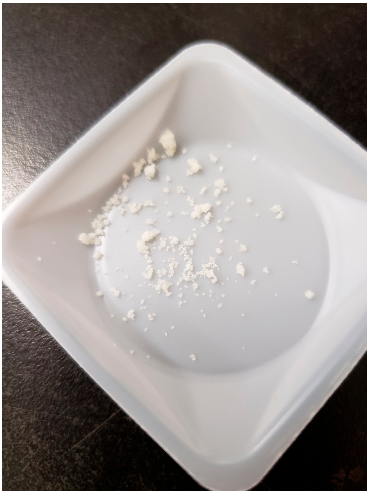
Figure S3. ADPH after lyophilization