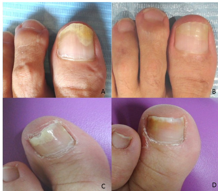
Figure 2. Same patient before and after treatment (A,B). Clinical improvement is observed, with a reduction in the affected area of the longitudinal axis from 68.57% to 20.00%. Another patient before and after treatment (C,D), showing clinically meaningful changes with a reduction in the affected area of the longitudinal axis from 41.94% to 28%.

Laser application achieved clinical improvement in 100% of the nails, although none showed complete remission of symptoms during the study period (Figure 2). No differences were found between the results according to the type of onycholysis and the alteration of the anatomical position of the toe.