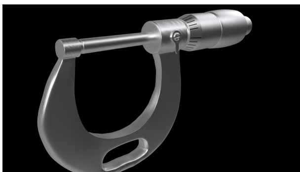
Figure 1. Three-dimensional model of an outside mechanical micrometer.