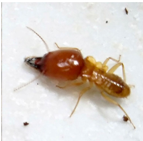
Figure 2. Subterranean soldier termite that found on the specimens.

During three months of in-ground testing, the wood specimens were attacked by subterranean termites that were identified as Macrotermes gilvus Hagen. Figure 2 illustrates subterranean termite soldiers found on the samples left in the field. The post-exposure wood specimens are shown in Figure 3. The percent weight losses (% WLs) of each species and treatment are displayed in Table 2. Analysis of variance Duncan's multiple range tests of each wood species and treatment are shown in Tables 3–5, respectively.