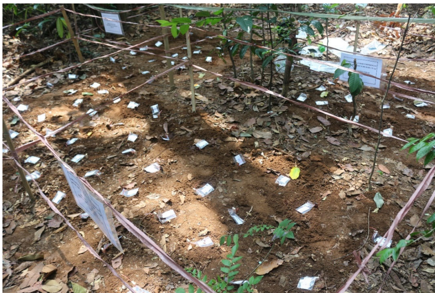
Figure 1. Subterranean termite field test.

\text{mm}\cdot\text{d}^{-1} ranging from 0.0 to 141.0 \text{ mm}\cdot\text{d}^{-1} , average relative humidity of 82.5% ranging from 61.0% to 96.0% [15].