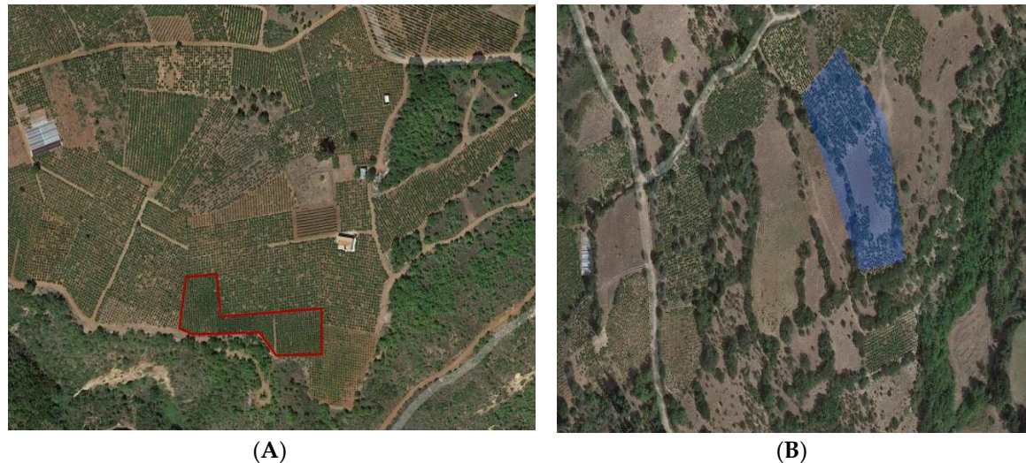
Figure 1. Vineyards in the prefecture of Achaia were the soil samples collected (A) Koutsoura ( 39^{\circ}13'01'' B, 23^{\circ}45'84'' A) and (B) Petsakoi ( 38^{\circ}25'46.8'' B, 22^{\circ}10'26.5'' A).

that one hundred individuals per species were tested per soil sample. Adults were placed on the soil surface, and either the soil was agitated or the containers were gently inverted/shaken periodically to ensure that the adults remained exposed to the soil. They were then left in dark chambers at 25 \pm 1 °C for fourteen days. Every seven days, mortality measurements were made.