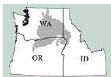
Figure 2. Regional Approaches to Climate Change in the Pacific Northwest (REACCH PNW) project area illustrating the major wheat producing region of the inland Pacific Northwest (iPNW).