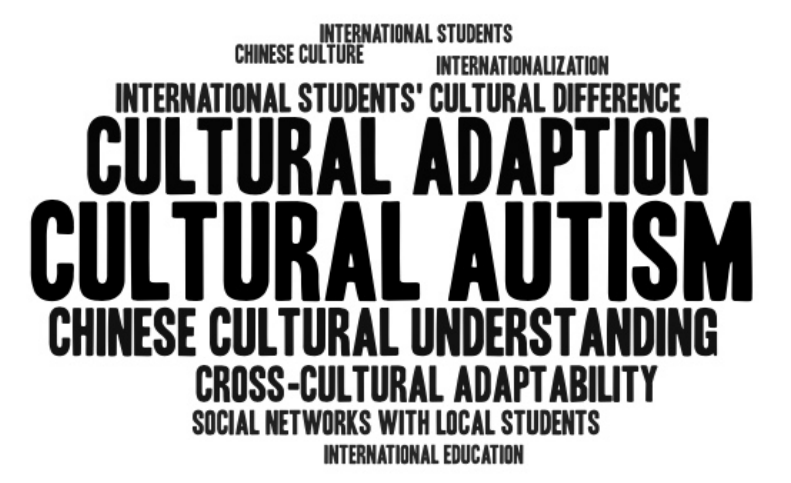
Figure 2. The cloud word analysis of top 10 high-frequency words.

Understanding Chinese culture is the primary problem. When international students have a good understanding of China, their cross-cultural adaptability will be enhanced, which will further promote their adjustment to Chinese culture. At present, international students' adjustment to Chinese culture is insufficiently understood in domestic academia, as research has mainly been conducted through empirical questionnaires, and the conclusions remain at the level of statements of fact. The education of international students is also closely related to their adjustment to Chinese culture. International students' understanding of, and adjustment to, Chinese culture is a long-term process of psychological construction that needs to be understood in terms of the psychological level, practical level, and other aspects. As foreign students have their own cultural backgrounds, we need to deal with the relationship between the foreign students' cultures and Chinese culture