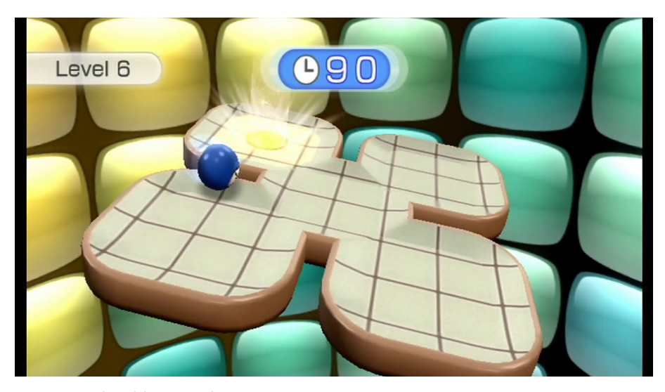
Figure 3. Tilt Table example.

The Nintendo Wii Fit Plus<sup>®</sup> is a video exercise game containing balance games, yoga poses, strength training, and aerobics. Games in the Nintendo Wii Fit Plus<sup>®</sup> targeting balance were selected by a physiotherapist and ranked to standardize the progression of exercises. During the training, the patient stands on a Wii Balance Board detecting the center of balance. The exercises focus on controlling the games using the patient's center of balance. The first session started with the games categorized as easier (Penguin Slide, Ski Slalom, Heading Soccer, Tilt Table, Perfect 10). During all sessions, the PTs encouraged the participants to get more difficult games (Tightrope Tension, Balance Bubble, Snowboard Slalom, Skateboard Arena, Table Tilt+, Balance Bubble+). Figures 3–6 show examples of games used during the treatments. The intervention was tailored to each participant's ability and preference. They registered the games played, time (in minutes) in resting during the sessions, made notes of everything that happened during exercise, and made comments regarding the progression. Adverse effects of rehabilitation (falls and injury during treatment, fatigue, and other complications) were recorded.