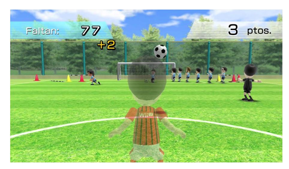
Figure 6. Heading Soccer example.