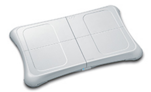
Figure 1. Nintendo Wii Balance Board.

The balance board, shown in Figure 1, is an accessory for Nintendo Wii video game console introduced in 2007. The Wii Balance Board has the shape of a domestic body scale and contains four pressure sensors that are used to measure the user's center of balance, i.e., the location of the intersection between an imaginary line drawn vertically through the center of mass and the surface of the Balance Board and weight. It communicates with the console via Bluetooth. Wii Fit was the first game to use the Wii Balance Board.