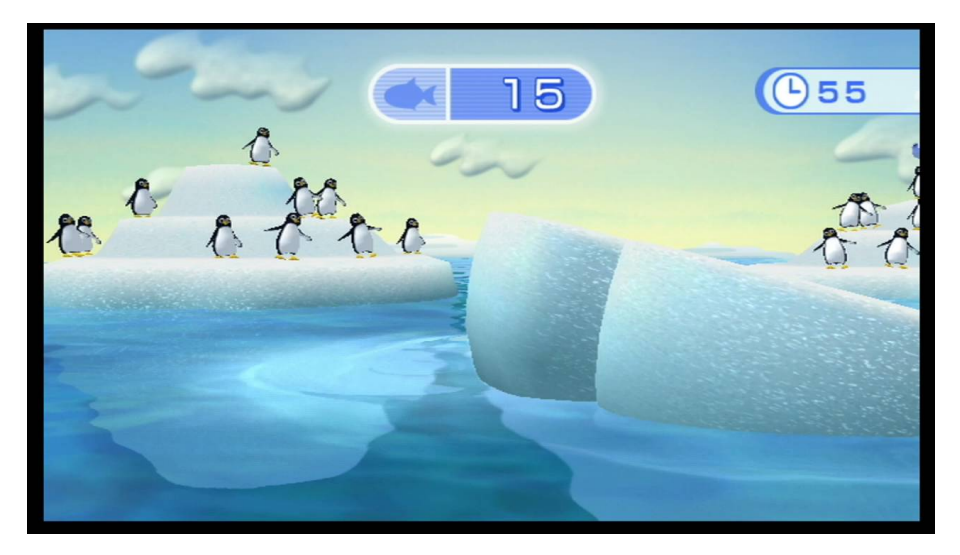
Figure 4. Pinguin example.