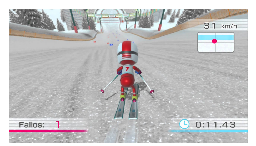
Figure 5. Ski Slalom example.