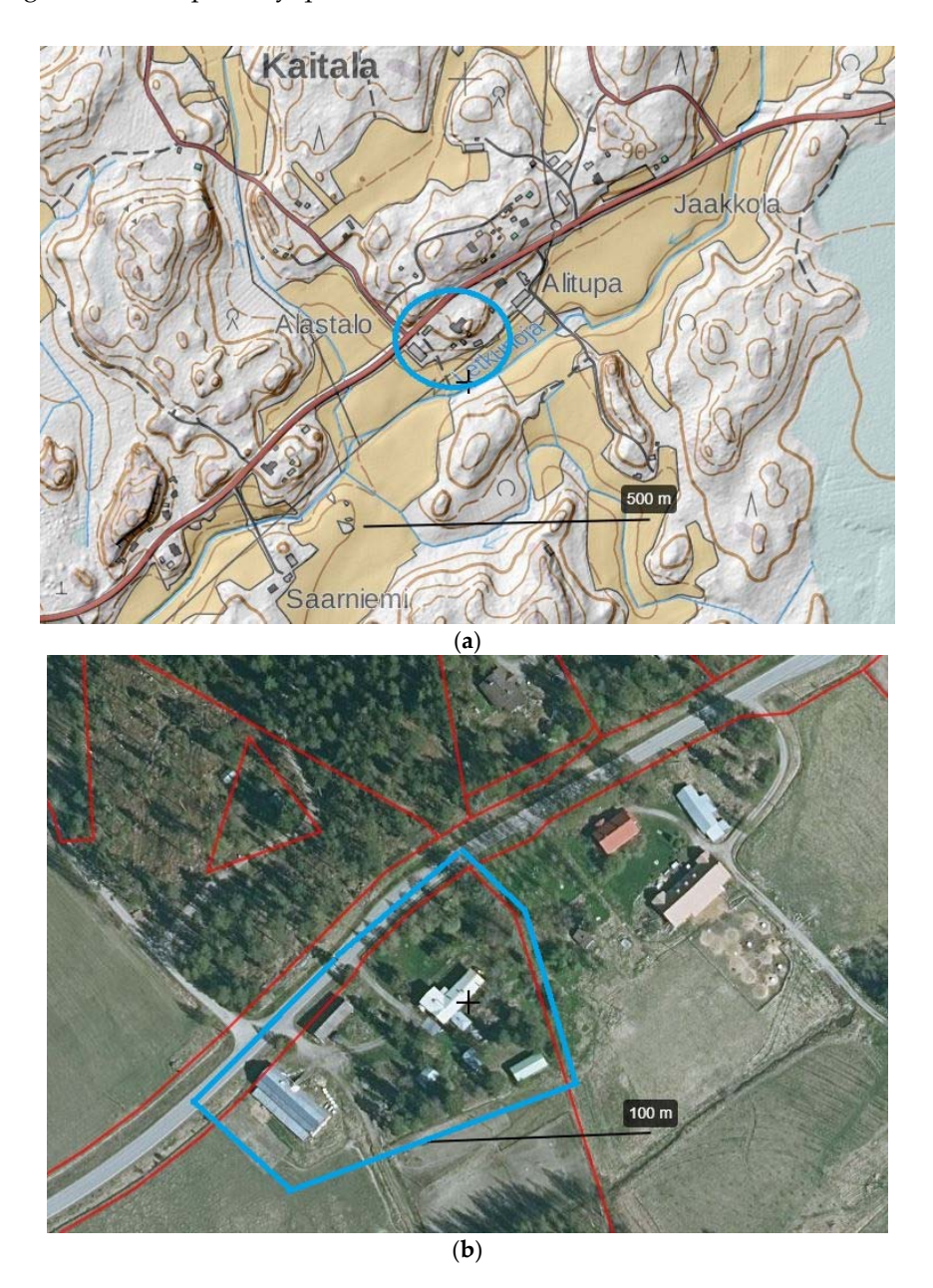
Figure 2. (a) The case study farm location in the village [20]. (b) Location of the case study buildings at the site [20].

horizontal log structures, except for a cow house built of cement brick in 1930. The roof materials are mostly steel and the largest storage hall has cement brick tiles. Similar traditional farmhouse complexes are quite usual in Finnish rural areas, and sometimes animal buildings are constructed of ordinary brick or granite stones. Natural granite stones have been used in the foundations of the residential building, but the stone surface has been covered with cement at a later phase. In the above table, the case study buildings and site are evaluated according to the proposed model and conclusions made dealing with the adaptability qualifications.