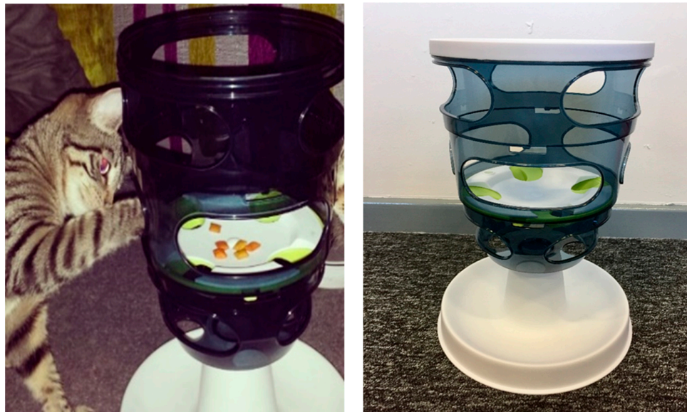
Figure 1. The Catit Senses Food Maze used to assess paw preferences.

Cats' paw preferences for food reaching were assessed using the Catit Senses Food Maze (Catit, UK). This maze is a 35.6 cm-tall spherical feeding 'tower', comprising three levels into which food can be placed. The food is accessed via three holes on each level (see Figure 1). For the purpose of this study, the top level of the food maze was removed as it proved too high for the cats to put their paws into without standing on their rear legs and compromising balance. The Catit has been used successfully to record cats' paw preferences [25,26] and demonstrates good test-retest reliability [46].