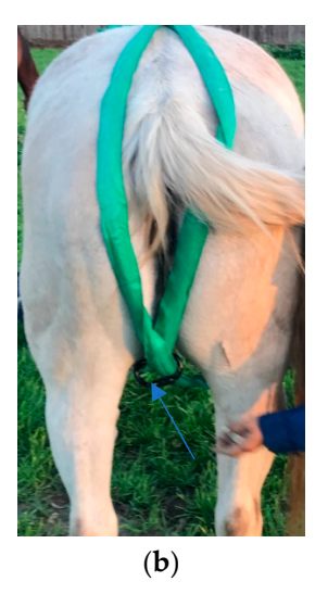
Figure 1. Cont.