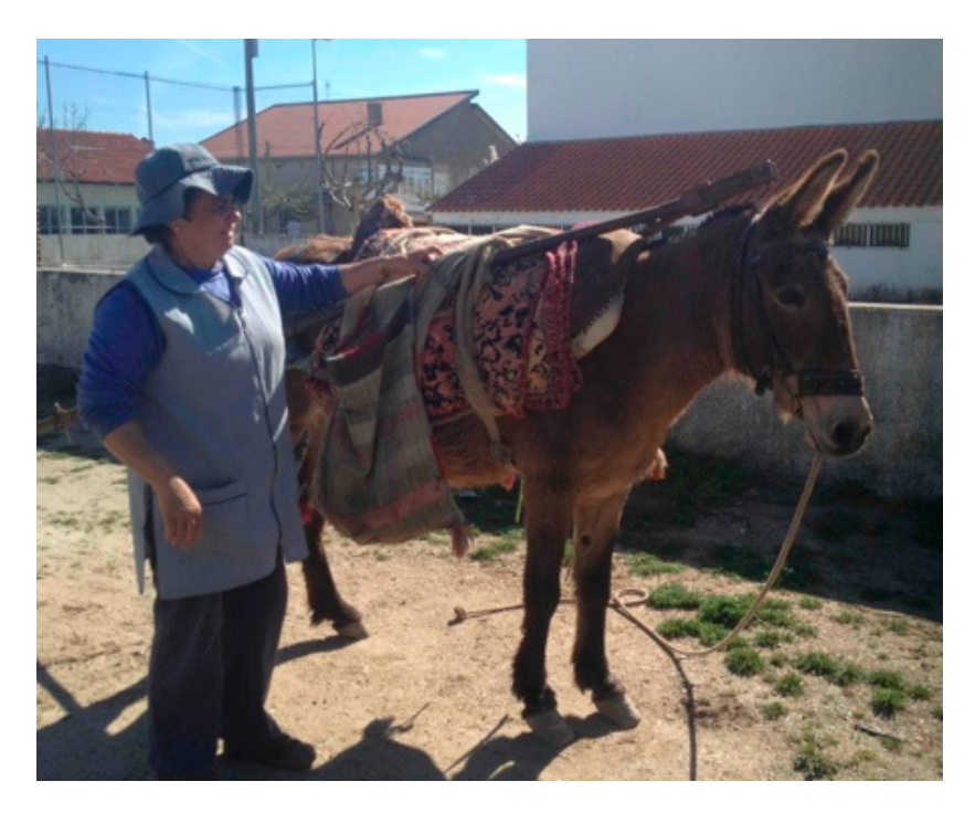
Figure 4. Hinnies are commonly found in many countries where access to mares has been traditionally limited. This particular hinny is used to plow and dig up potatoes and assist with harvesting grapes in Portugal. In some places they are preferred over mules.

To understand preferences for breeding hinnies or owning/working/showing hinnies compared to mules, horses, or donkeys, the authors asked those who are actively breeding and using hinnies to complete a survey. The surveys were conducted with hinny breeders and owners in Colombia, Mexico, Portugal, United States and Spain. The results suggested that hinnies were very sturdy animals, similar to mules, but inherited traits that closely resembled the stallion (e.g., gait of Paso Fino hinnies in Colombia, or conformation of superior Quarter Horses for show hinnies in the U.S.) [14,15,26] (Figure 4).