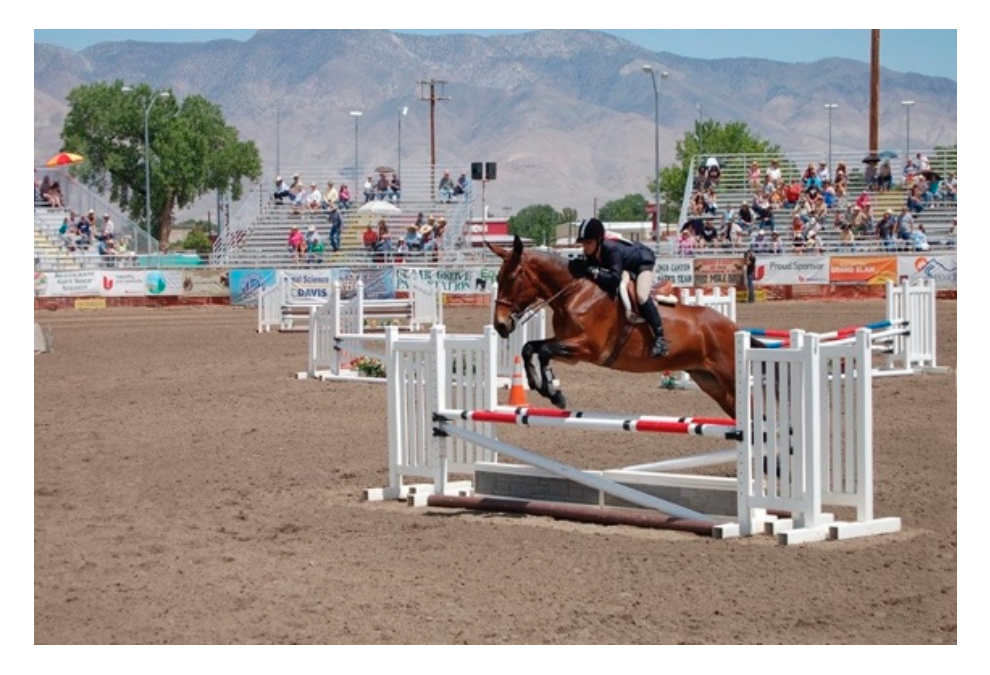
Figure 1. Mules and hinnies can be trained to compete in multiple disciplines, just like horses. The U.S. has seen a growth in mules, hinnies, and donkeys for recreation and competition mounts.

The Equus family includes horses, donkeys, mules, and hinnies. Globally, there are 14 million mules and hinnies—the smallest sector of the equid population (112 million, 50 million horses, and 54 million donkeys) [1]. A mule is the cross between a male donkey, a jack, and a female horse, a mare. The reciprocal cross produces a hinny. They serve important roles as working equids generating critical income and have grown in popularity amongst horse owners looking for recreation and competition mounts worldwide [2–4]. Mules can be trained to compete in multiple disciplines, from dressage, jumping, Western riding, reining, and racing [5] (Figure 1). In the U.S., the mule and donkey population increased from 2007 to 2012 even as the number of U.S. horses and ponies declined [6].