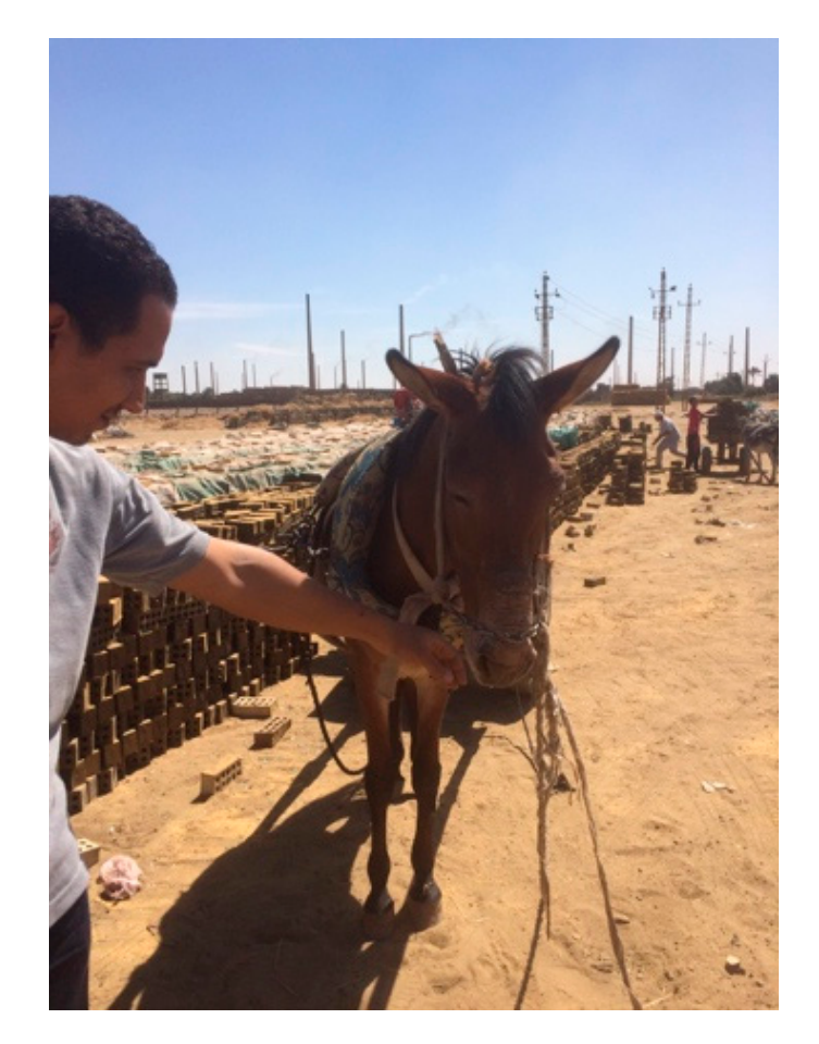
Figure 5. Approach tests in six countries have shown that mules are more accepting of familiar versus unfamiliar people. This makes attempting routine veterinary or husbandry procedures more challenging when treatment is being provided by an unfamiliar person [14,16].

Moreover, such interspecies differences between mules, donkeys and horses may extend beyond the context of spatial cognitive abilities to traits such as trainability and tolerance to humans in either an approach or a contact test by familiar/unfamiliar handlers. Working mules and hinnies that were used to pull loads were less tolerant of an approach by unfamiliar handlers and showed more trust to familiar handlers [10,15,16,32] (Figure 5). Pritchard et al. [16] found that mules being rented for riding purposes in India were likely to be more fearful due to inappropriate handling and compromised welfare. When the animal is rented versus owned, the bond or trust with the owner and mule is likely compromised and the new handler may use harsher methods of handling the mule out of fear [16]. Similar behavior observations have been noted when unfamiliar people are interacting with other animals [16].