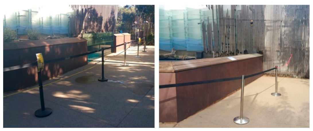
Figure 2. Setup of the barrier in the exhibit area.