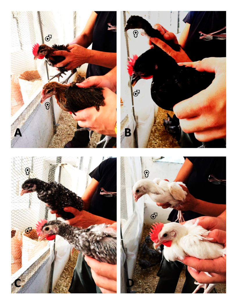
Figure 3. Sex dimorphism across Utrerana hen breed varieties at age 1.5 months with ( A ) showing a Utrerana partridge variety cockerel and pullet, ( B ) a Utrerana black variety cockerel and pullet, ( C ) a Utrerana franciscan variety cockerel and pullet, and ( D ) a Utrerana white variety cockerel and pullet.

Utrerana pullets and cockerels develop secondary sexual features at 6 weeks of age as shown in Figure 3, hence the real sex of the animals could be confirmed.