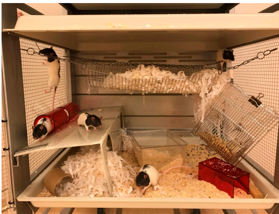
Figure 2. Refined rat housing which allows the animals to rear and climb. All the rats at RISE (Research Institutes of Sweden) are housed in modified rabbit cages.

As a thought experiment, we could consider how rat housing would look if legal minimum standards had to be designed from a blank slate, instead of the current situation in which a case had to be made to increase from a very low (literally!) baseline of a minimum cage height of 14 cm. As was the case when the last standards were set, there is an evidence base in the literature, with examples of good practice. If the standards were being defined today, would cages be significantly larger, with more than one level and high enough for all the rats to stand at once? This is already achievable, with appropriate infrastructure to deal with moving and cleaning the caging, as in the Research Institutes of Sweden shown in Figure 2. We can only speculate as to the counterinfluences that would be exerted by economic factors and perceptions regarding what would be a fair compromise between human and animal needs, and how all of these factors would be balanced. However, individual establishments can consider investing in better rat caging at any time, regardless of legal minimum standards, in accordance with their own Culture of Care.