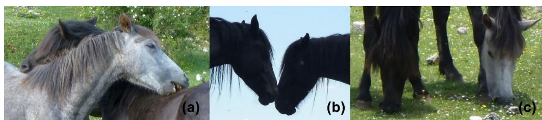
Figure 1. Pairwise involvement in (a) mutual grooming, (b) friendly approach, and (c) spatial proximity.

Affiliative approaches (Figure 1b) were counted when a horse approached and stayed within one body length of another horse, when an approach elicited a reciprocal affiliative reaction (the approached animal moving towards the approacher) or a neutral reaction of the approached horse (the approached animal did not move). Approaches that resulted in grooming were not considered, so that the friendly approach and grooming data were mutually exclusive.