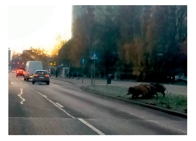
Figure 2. Wild boars in the city of Szczecin, on the Przyjaciół Żołnierza Street. This place is located in the western part of Szczecin, 2.9 km from the city centre.