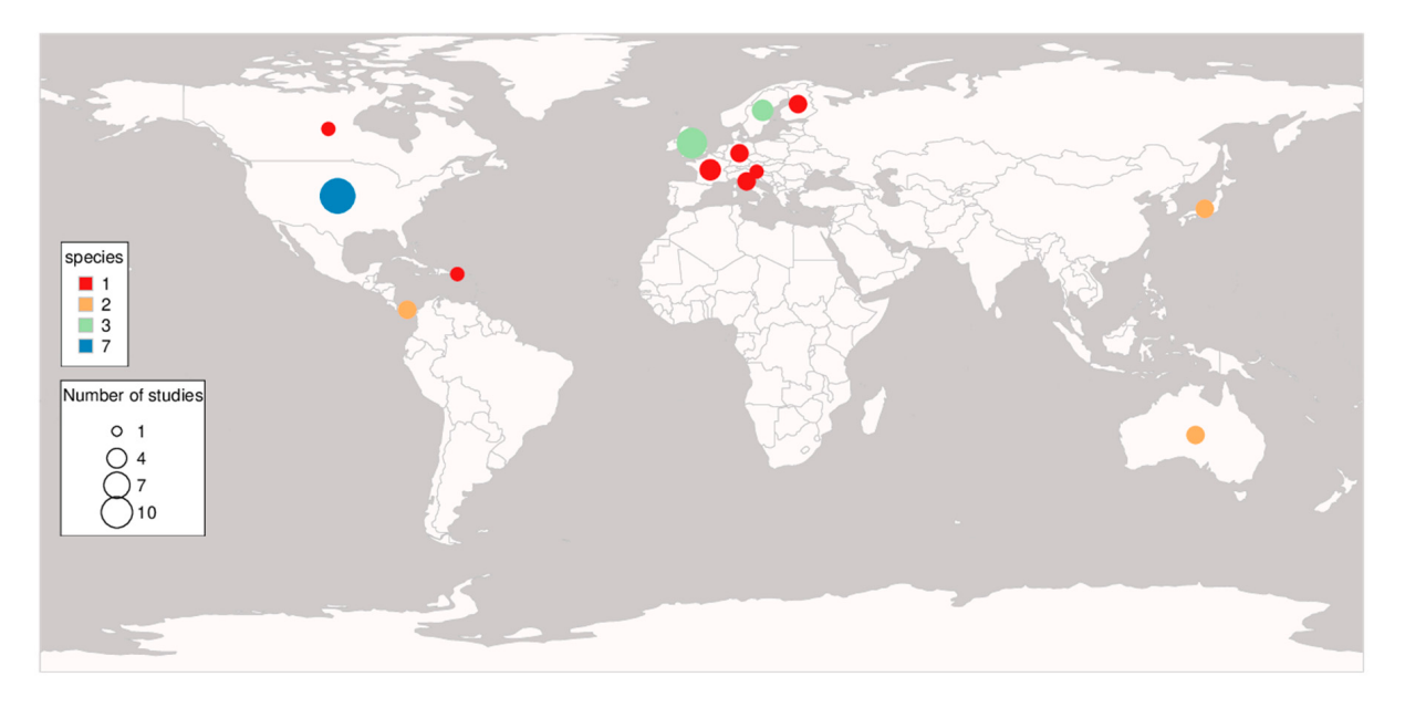
Figure 2. Distribution of studies reporting genetic diversity of populations or individuals and correlations to fitness-related traits in amphibians.

were included in more than one study (Figure 2, Table S1). We excluded the study of six Brazilian [34] species from Figures 1 and 2 as well as Table 1 because information on the genetic diversity and fitness was not available at the species level. However, the study is still included in Table S1 and last table since the relationship between forest fragmentation and Bd infection is relevant.