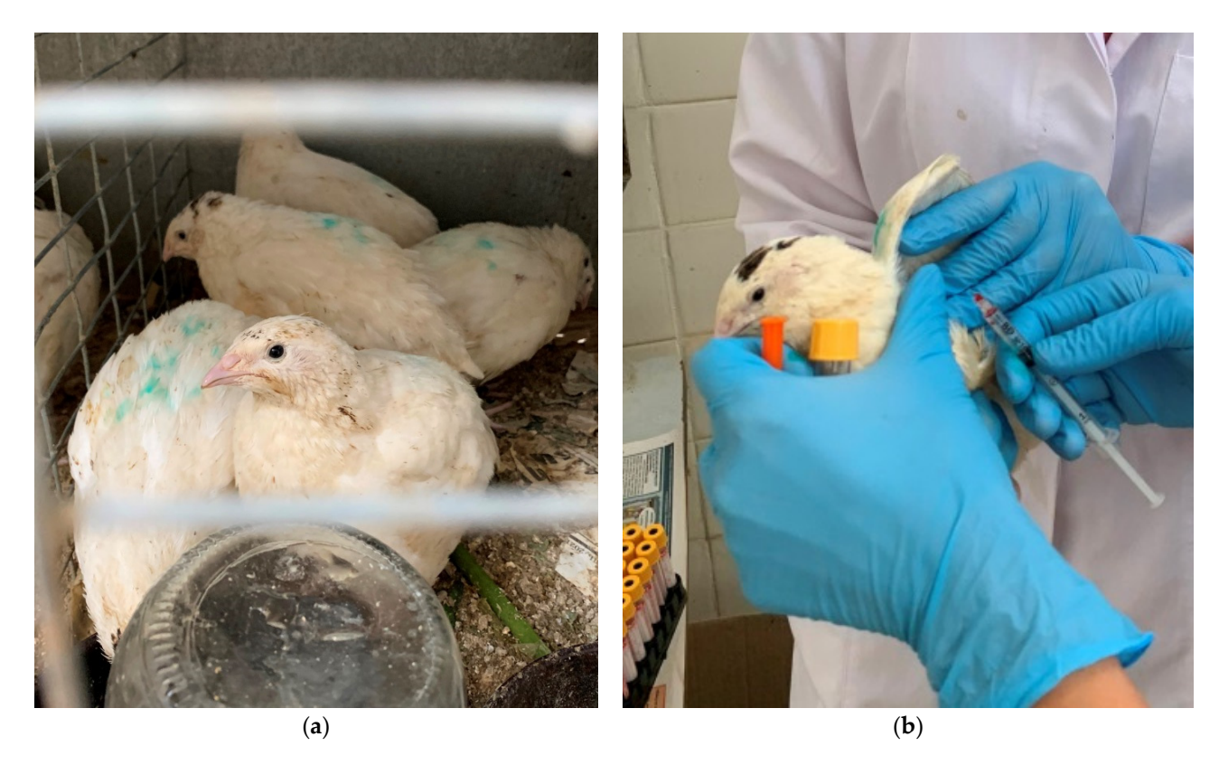
Figure 1. Experimental infection quails with Candida albicans ATCC 10231: (a) Birds in a cage; (b) Taking blood from quails for biochemical studies from the axillary vein.