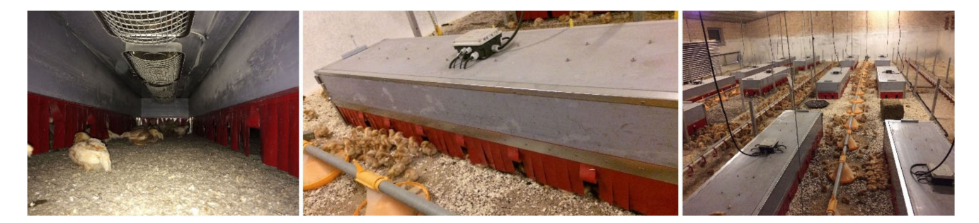
Figure 3. Home-built dark brooders in an organic commercial pullet farm. The brooders have a lid for the farmer to easily inspect the chicks underneath the brooder. Left: inside with heaters mounted on the ceiling, middle: outside with a temperature control system on the top and parts of the fabric fringes lifted to guide the chicks in and out of the brooder and right: barn with brooders positioned between the feeder and drinker lines.

The main problem in the low usage of dark brooders is probably that there are no commercial options for large-scale pullet rearing. While a single company advertises dark brooders on their website, they seem to be in the prototype phase (i.e., we were not able to purchase one). Thus, farmers are left on their own to build dark brooders and establish the best management practices (e.g., Figure 3).