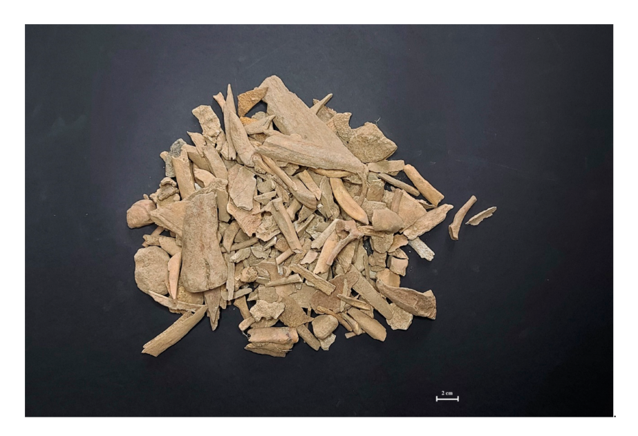
Figure 3. Typical of animal bone assemblage from Kamienna Góra site.

The morphometric analysis of investigated assemblages was possible only in the bone remains form Złotoryja and Kamienna Góra. Strong fragmentation of accessible material (Figure 3) excluded this stage of archaeozoological analysis in many cases. The achieved results were shown in Tables 4-6.