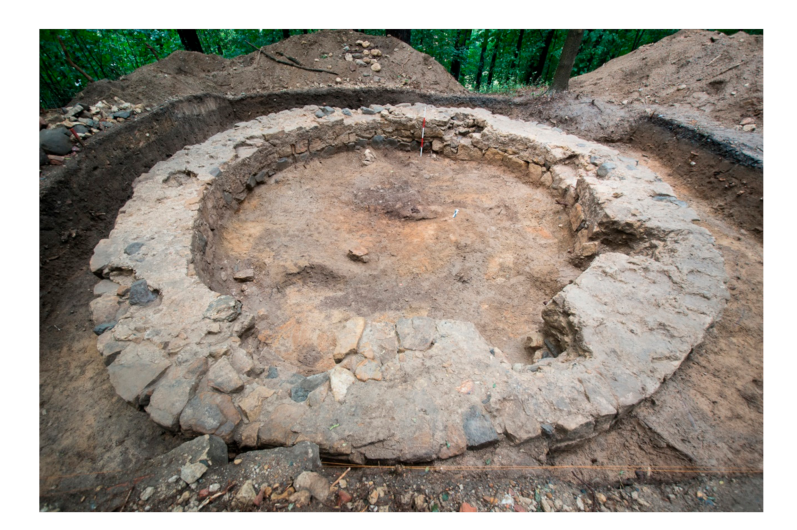
Figure 6. Unearthed gallows buttress at Złotoryja site.

Traditional gallows were typical features of the Silesian suburban landscape until the 19th century. Sometimes larger villages had such places, but to gain some local prestige rather than to use them as intended [39]. The majority of execution places were surrounded not only by dishonored human cemeteries, but also dog catcher waste pits, also known as fields (German: Schindergrube, Schinderanger, Schinderplatz), as executioners were also responsible for the disposition of bodies or remains of stray, useless, or dead animals. Both human and animal skeletal remains were treated similarly, without any esteem [24–28,41]. Archaeological explorations of execution places in early modern Silesian towns revealed that the central point of such facilities was a cylindrical well-like brick construction with three or four pillars and a crossbeam at its crown (Figure 6).