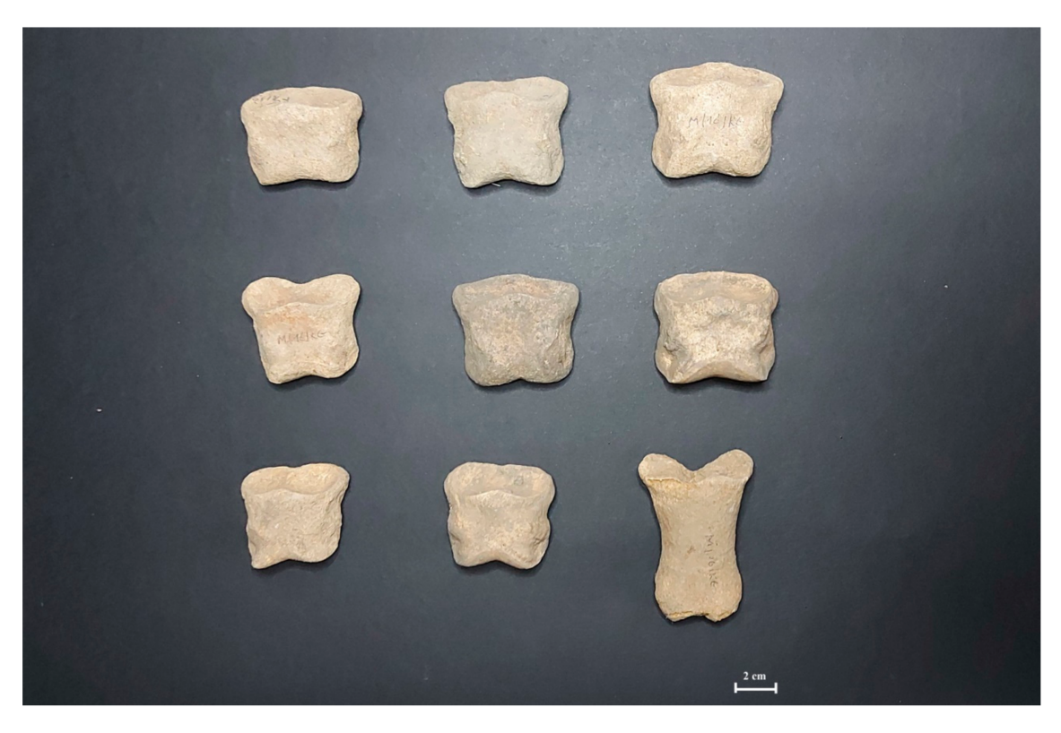
Figure 4. Horse phalanges discovered at Kamienna Góra site.