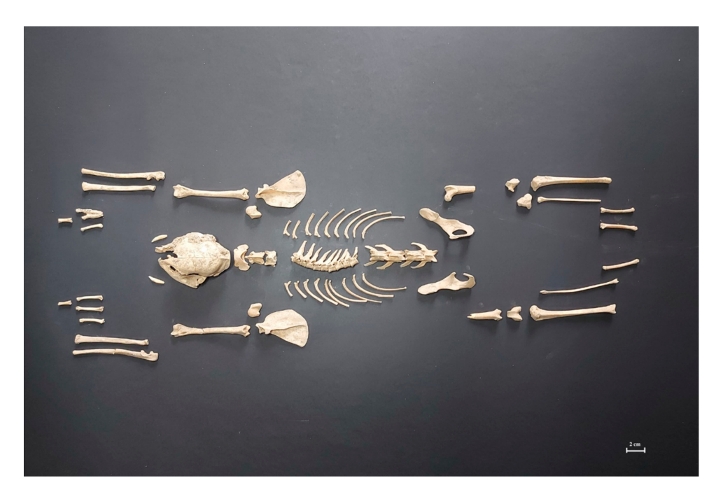
Figure 2. Incomplete domestic cat skeleton unearthed at Złoty Stok gallows site as the example of only discovery that was accessible for archaeozoological analysis.

Table 2. Frequency of taxa in NISP, archaeological site at Złotoryja, Kamienna Góra and Jelenia Góra. Bos , cattle; Sus , swine; Ovis , sheep; Ovis/Capra , sheep/goat group; Equus , horse; Canis , dog; Canis/Felis , dog/cat group; Canis/Canis lupus dog/wolf group; Felis , cat; Canis lupus , wolf; Vulpes , fox; Sus scrofa , wild boar; Sus/Sus scrofa , swine/wild boar group; Talpa , mole; Mus , mouse; Rattus sp. , rat; Lepus , hare; Rodentia , rodents; Homo , human; Gallus , hen; Anser , goose; Aves , birds; Corvus , crow; Gastropoda , snail. Kamienna Góra no. 1/13 present the NISP estimated in skeletal material from the complete animal-catcher waste pit unearthed within the Kamienna Góra gallows site.