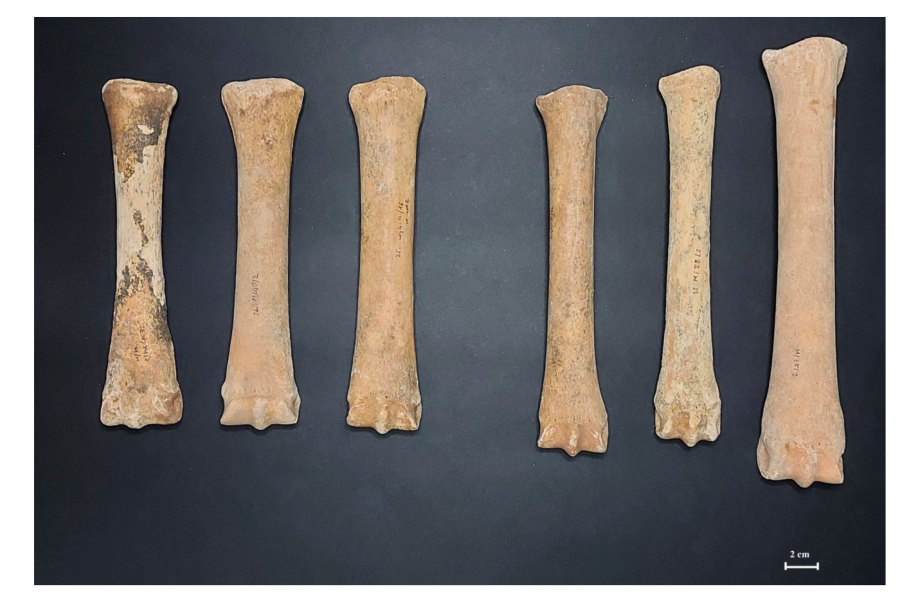
Figure 5. Horse metapodial discovered at Złotoryja site.

The excess of horse's trunk skeleton elements is typical for classical consumptive materials, highlighting an important difference compared with animal bone assemblages from the knackers' yard (Table 7). The typical consumptive skeletal remains assemblages are characterized by clear predominance of domestic species, such as: cattle, pig, sheep/goat group, etc., as the most frequent source of animal meat for humans from Neolith to Early Modern Times [5,43–45]. Such archaeozoological analyses proved that the bone remains of horses and dogs usually do not exceed ca. 3% of NISP for horses and ca. 5% of NISP for dogs. Simultaneously, the horse's skeletal remains classified as inhumations show the lack of other taxa, what can be interpreted as a result of intentional human activity [55]. Moreover, in this study, we observed a clear predominance of caudal vertebra remains versus others of the vertebral column. This can be explained by the fact that, together with the great number of phalanges and distal appendices, the skeletal remains of horses were treated as waste and unfit from a culinary point of view (Figures 4 and 5).