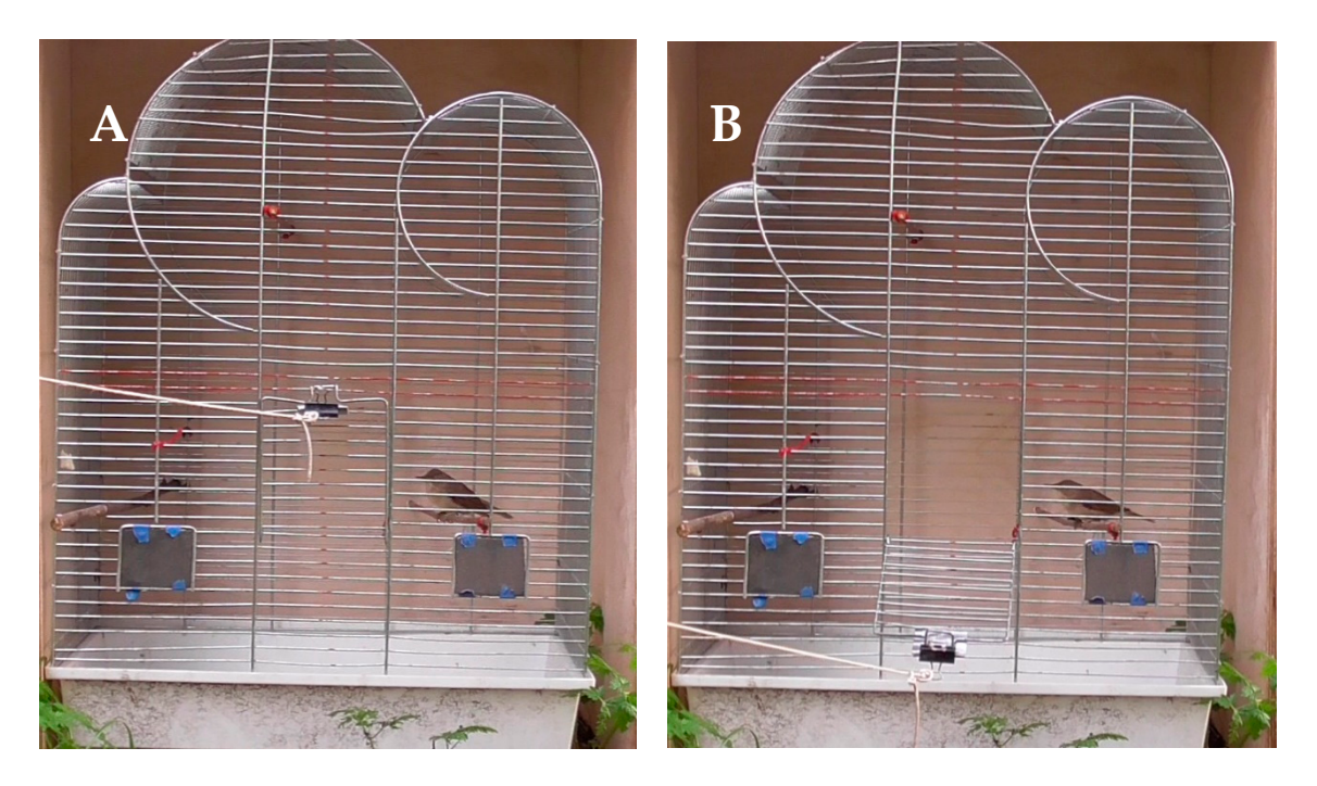
Figure 2. Experimental cage setting with the Reed Warbler before (A) and after (B) cage door opening.